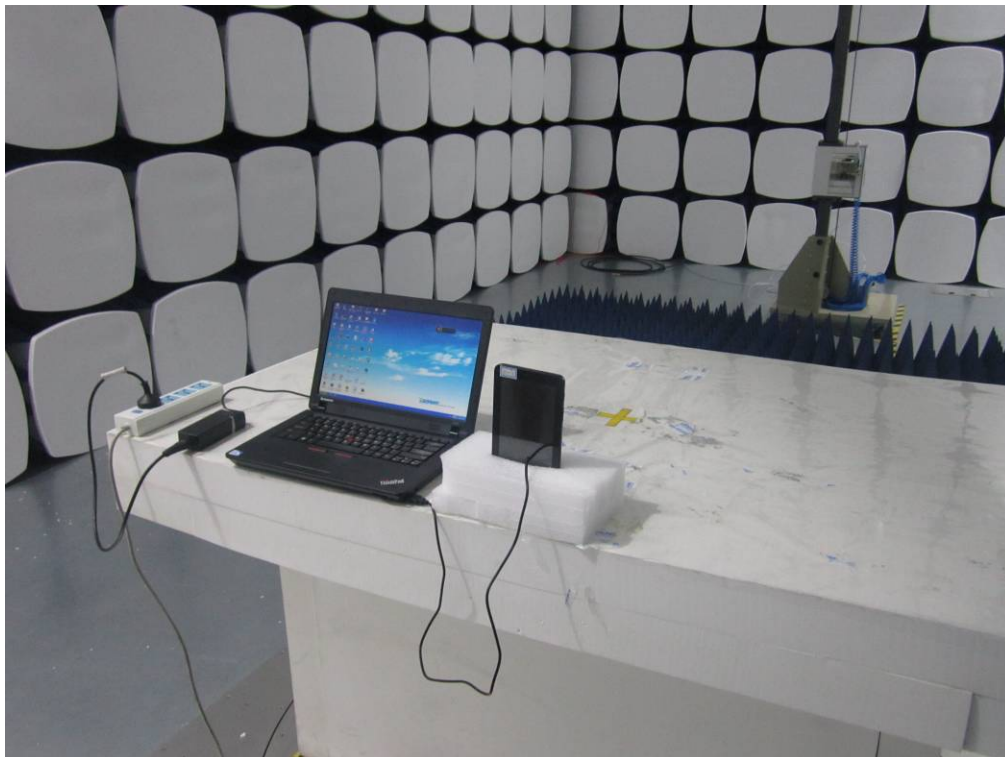
Radiated Spurious Emissions Test Setup Above 1GHz –Front View