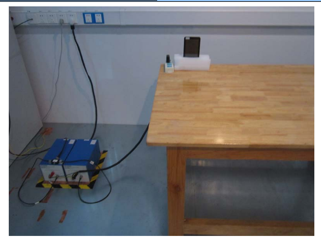
Conducted Emissions Test Setup Front View