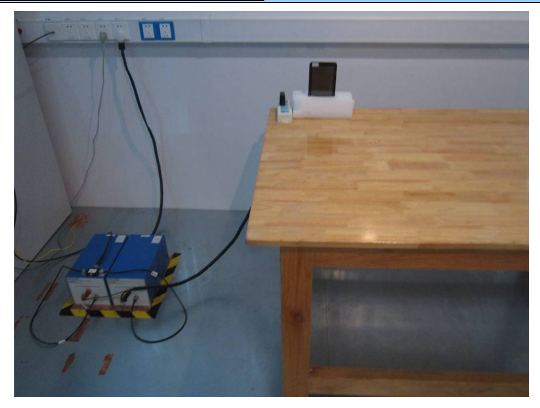
Conducted Emissions Test Setup Front View