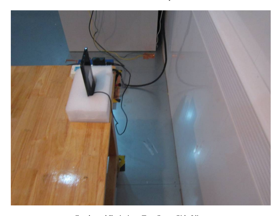
Conducted Emissions Test Setup Side View