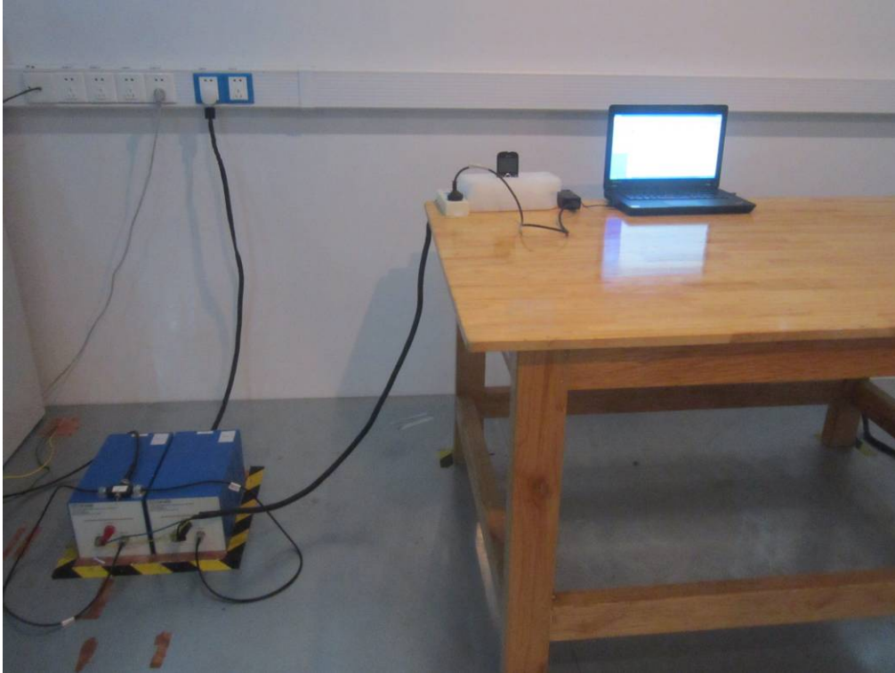
Conducted Emissions Test Setup Front View