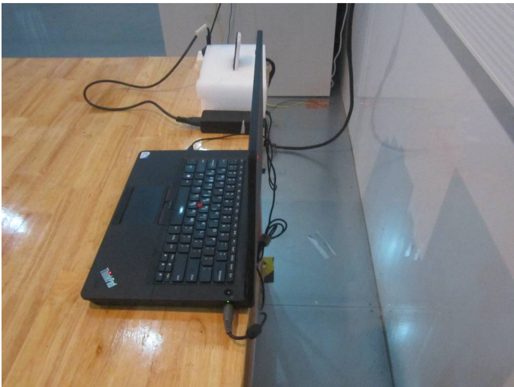
Conducted Emissions Test Setup Side View