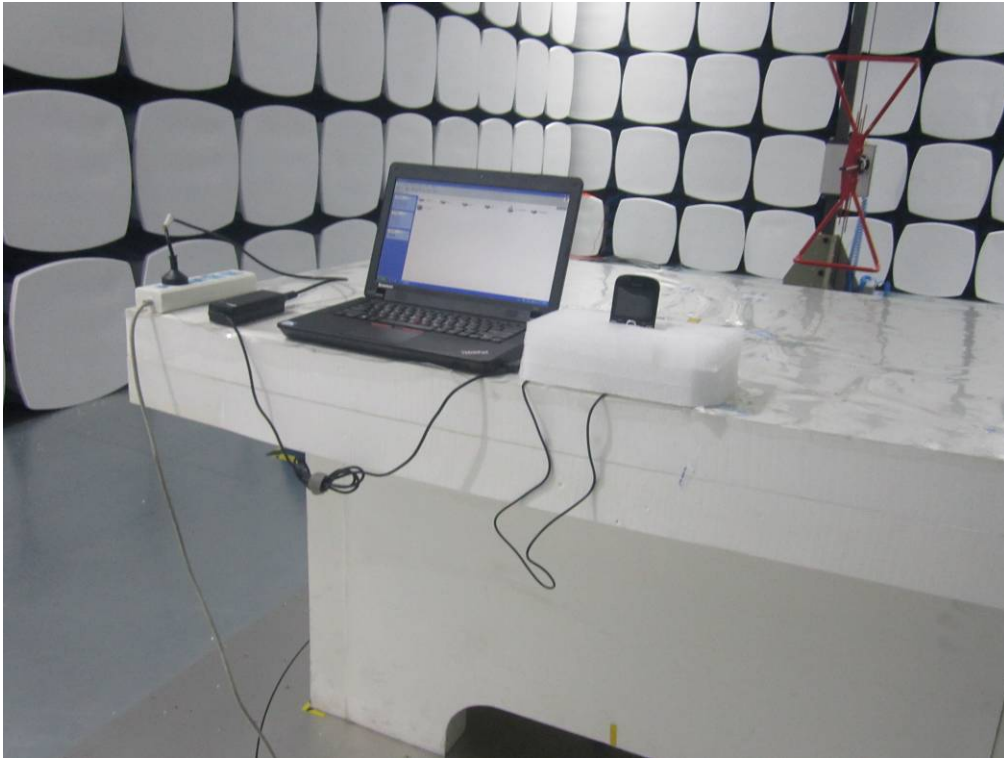
Radiated Spurious Emissions Test Setup Below 1GHz - Front View

Report No.: 14070224-FCC-E1 Issue Date: May 27, 2014 Page: 29 of 35 www.siemic.com www.simmic.com.cn