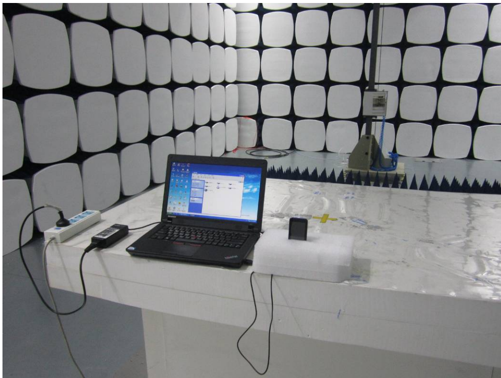
Radiated Spurious Emissions Test Setup Above 1GHz - Front View