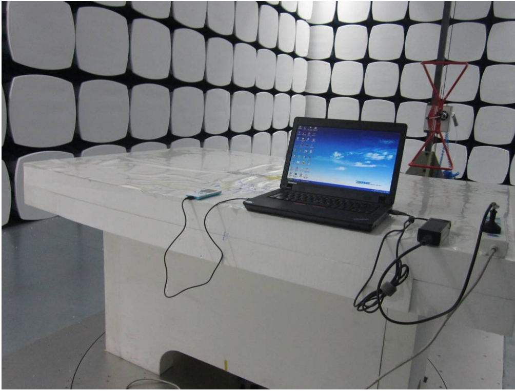
Radiated Spurious Emissions Test Setup Below 1GHz - Front View

Report No.: 14070217-FCC-E1 Issue Date: May 22, 2014 Page: 29 of 35 www.siemic.com www.simmic.com.cn