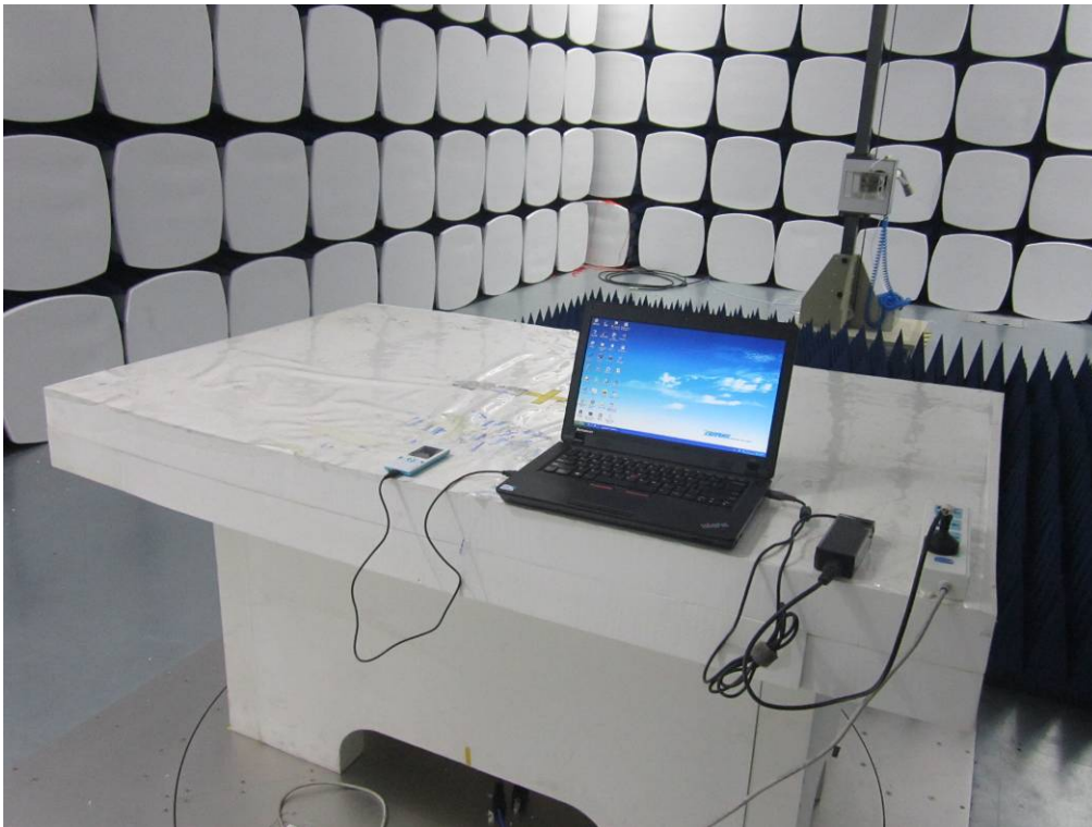
Radiated Spurious Emissions Test Setup Above 1GHz - Front View