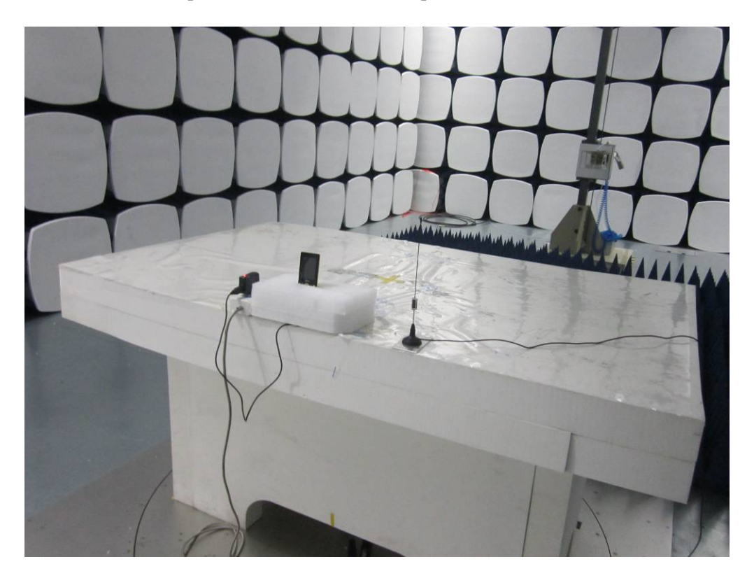
Radiated Spurious Emissions Test Setup Above 1GHz -Front View