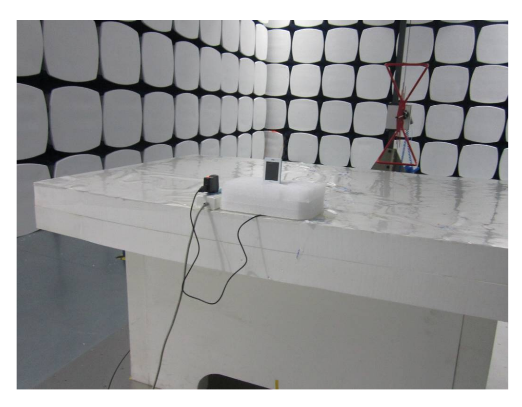
Radiated Spurious Emissions Test Setup Below 1GHz - Front View

Report No: 14070216-FCC-R2 Issue Date: May 22, 2014 Page: 52 of 58 www.siemic.com www.siemic.com.cn