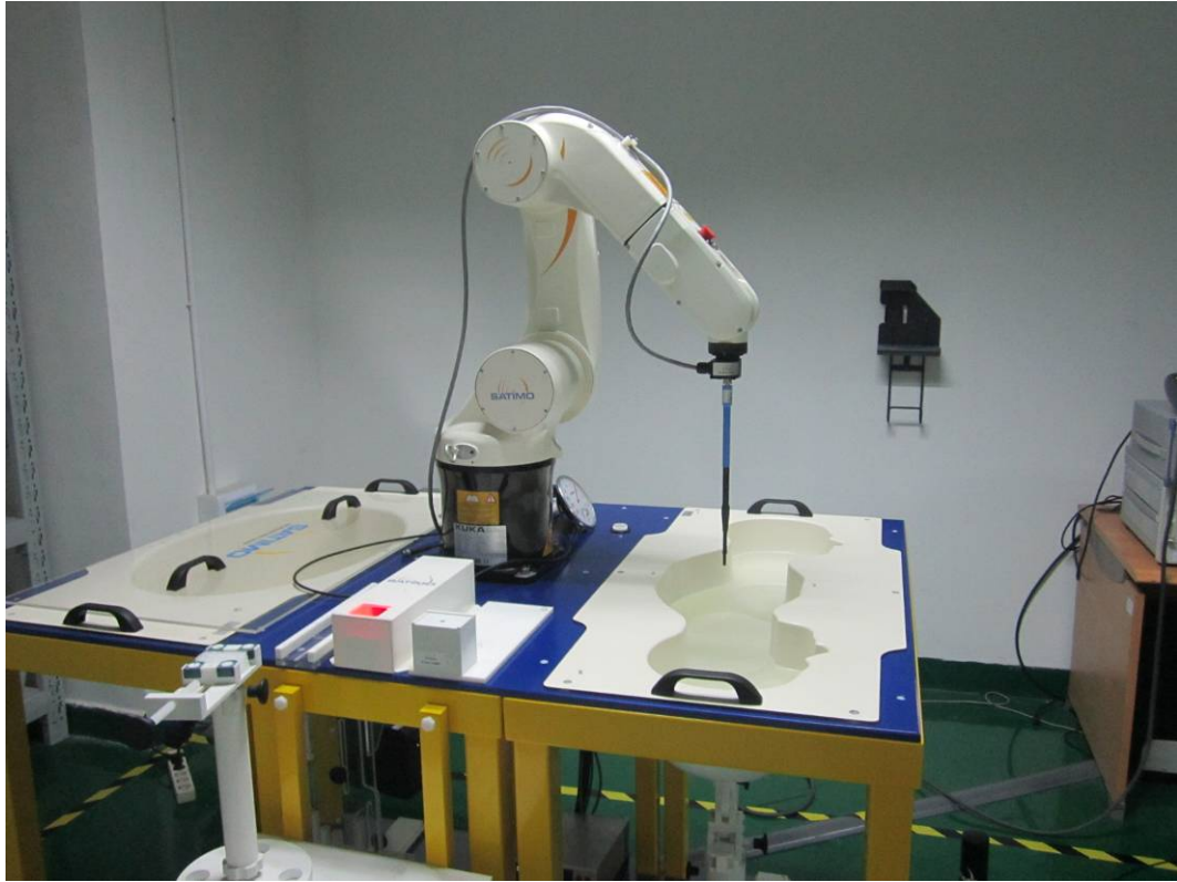
Liquid depth \geq 15cm