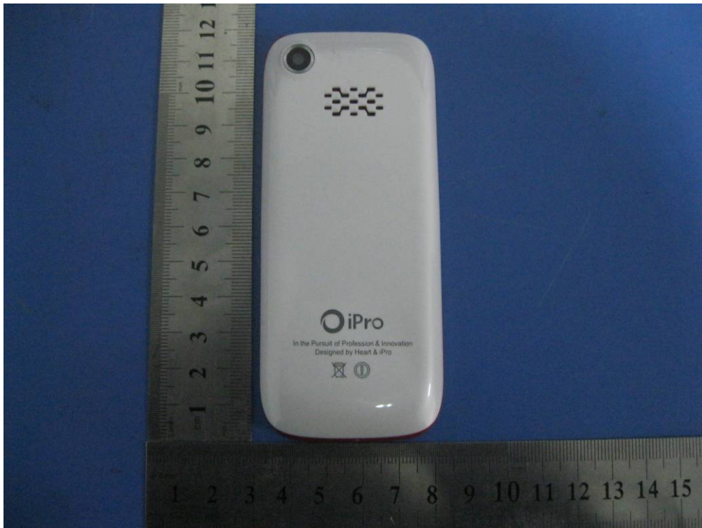
EUT - Rear View