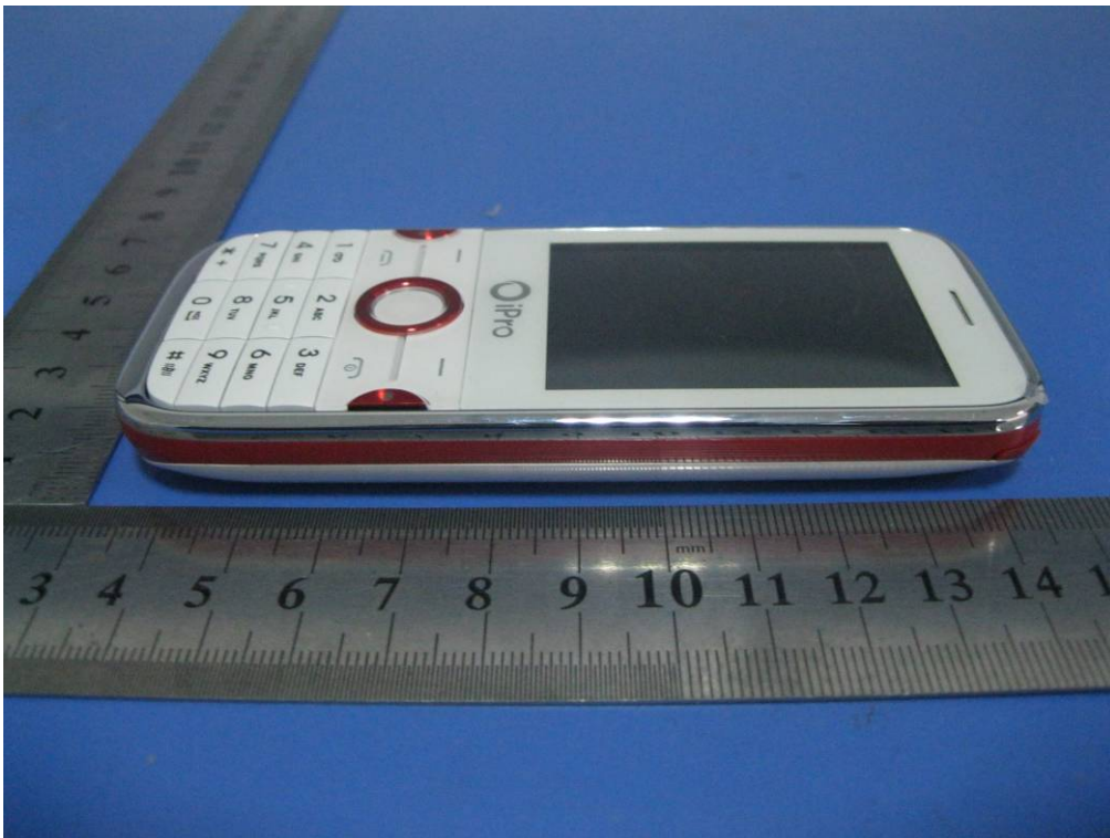
EUT - Right View