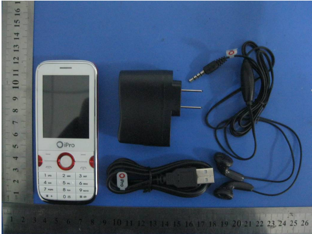
EUT – The Whole Package View