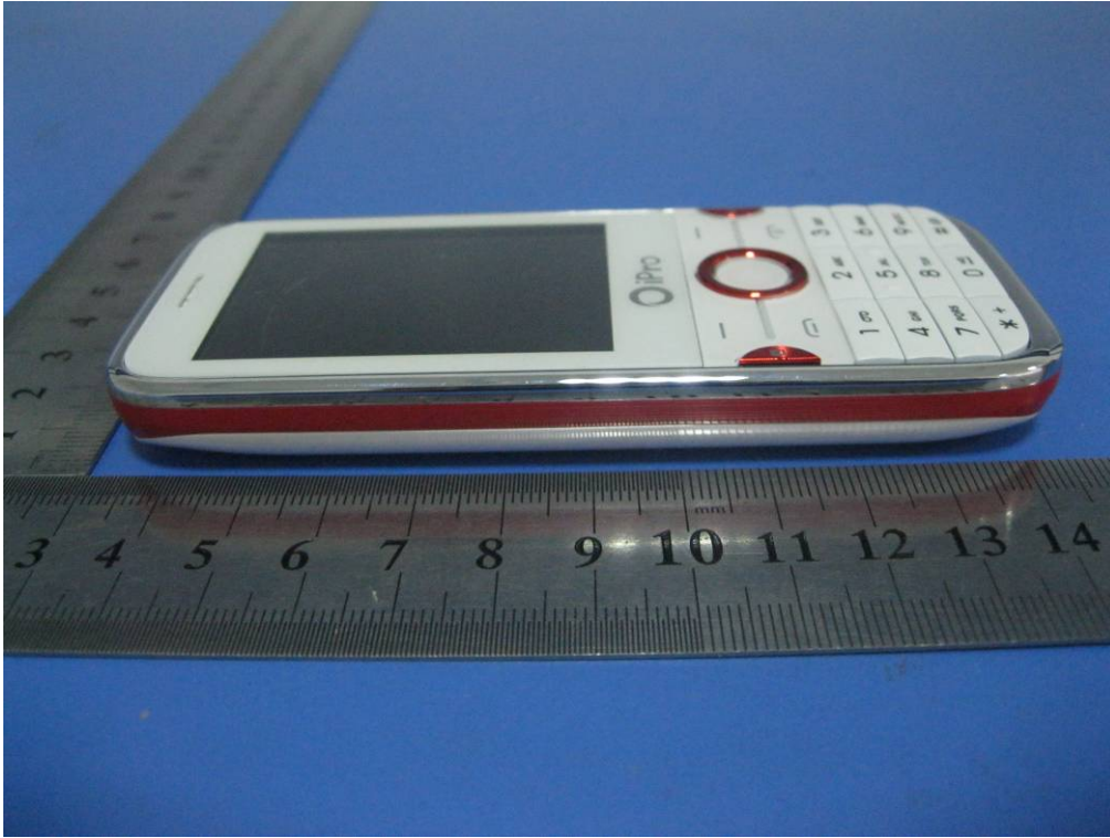
EUT - Left View

Report No.: 12070344-FCC-E1 Issue Date: December 24, 2012 Page: 22 of 36 www.siemic.com