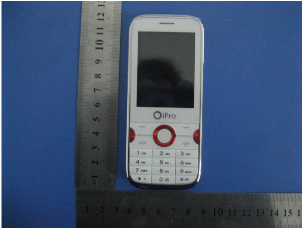
EUT - Front View

Report No.: 12070344-FCC-E1 Issue Date: December 24, 2012 Page: 20 of 36 www.siemic.com