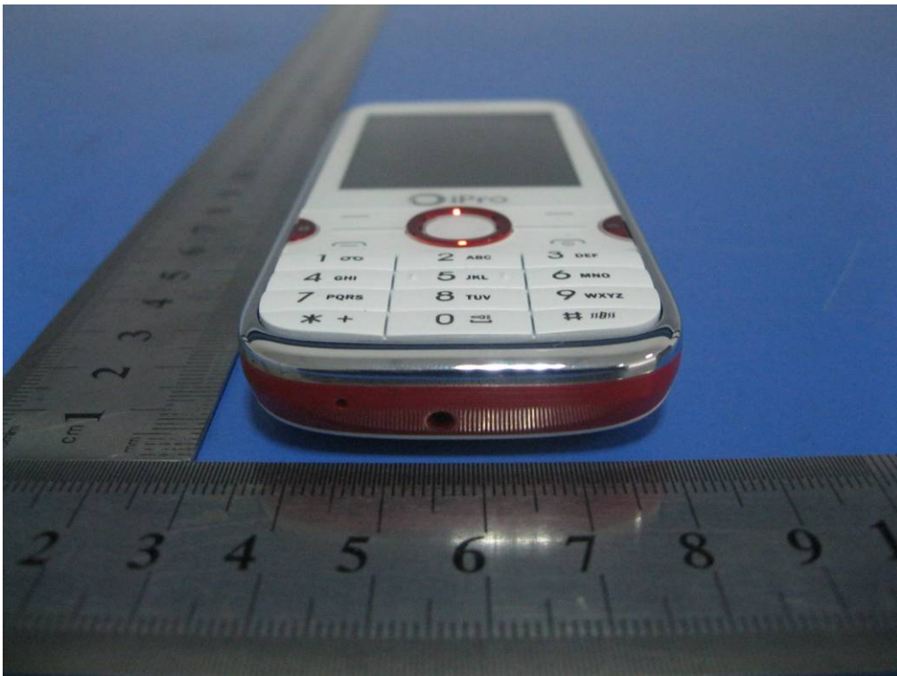
EUT - Bottom View