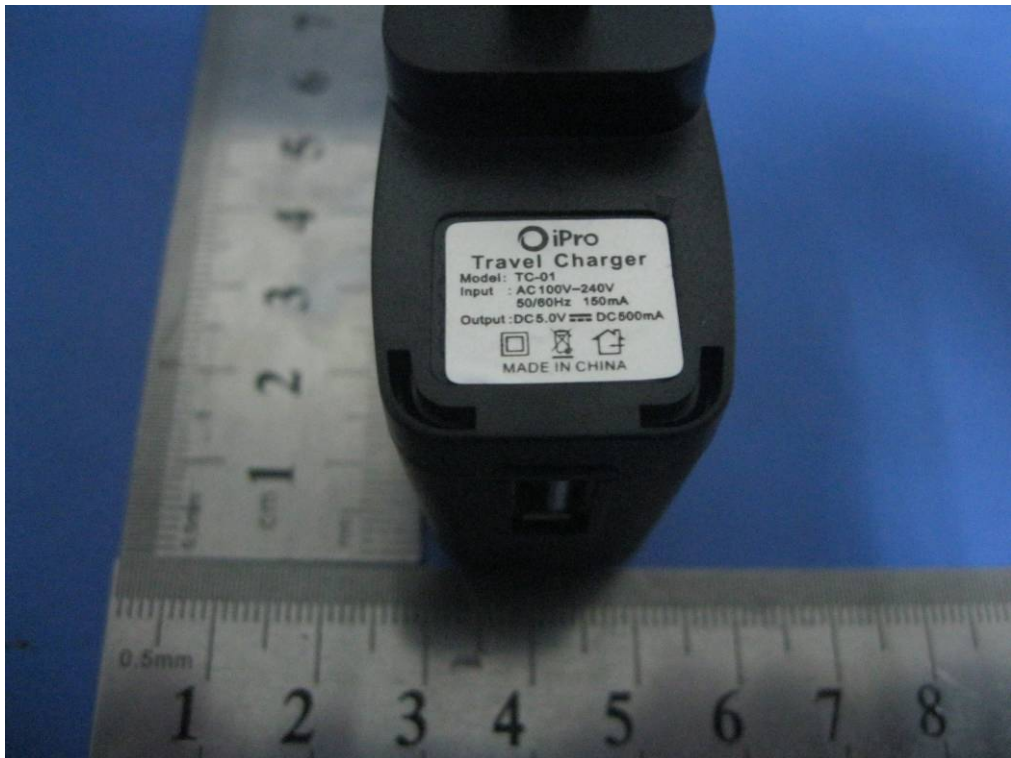
EUT - Adapter View