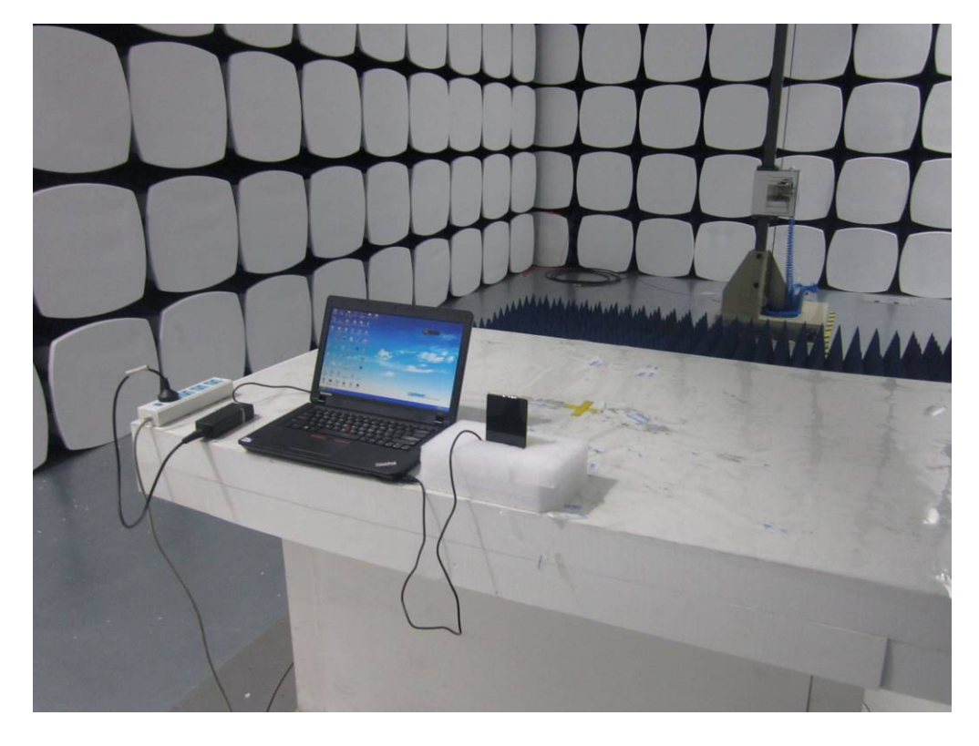
Radiated Spurious Emissions Test Setup Above 1GHz -Front View