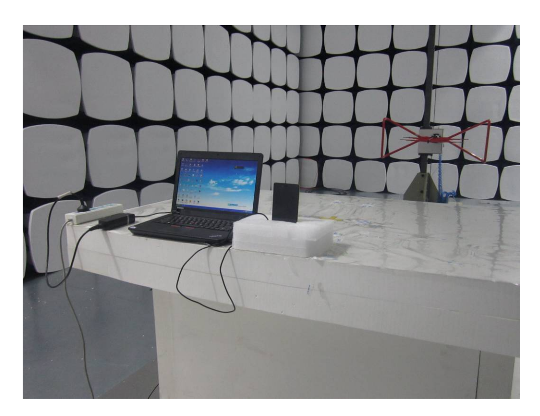
Radiated Spurious Emissions Test Setup Below 1GHz - Front View

Report No.: 14070282-FCC-E1 Issue Date: July 07, 2014 Page: 32 of 38 www.siemic.com