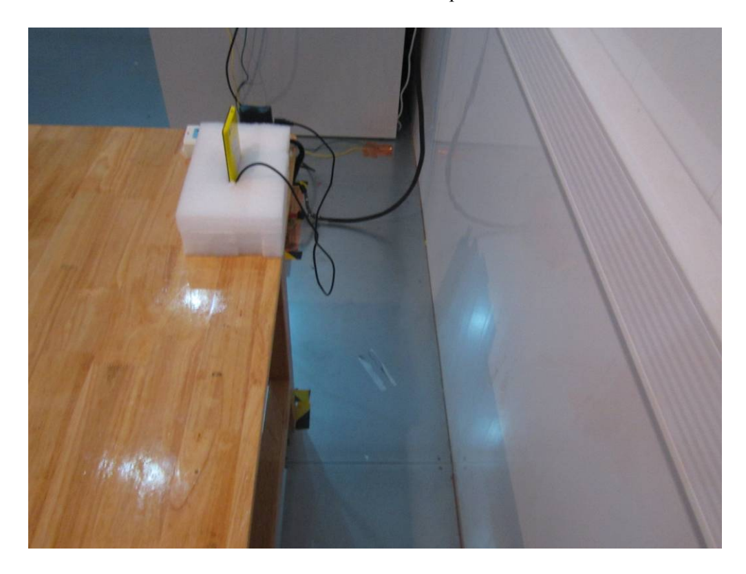
Conducted Emissions Test Setup Side View