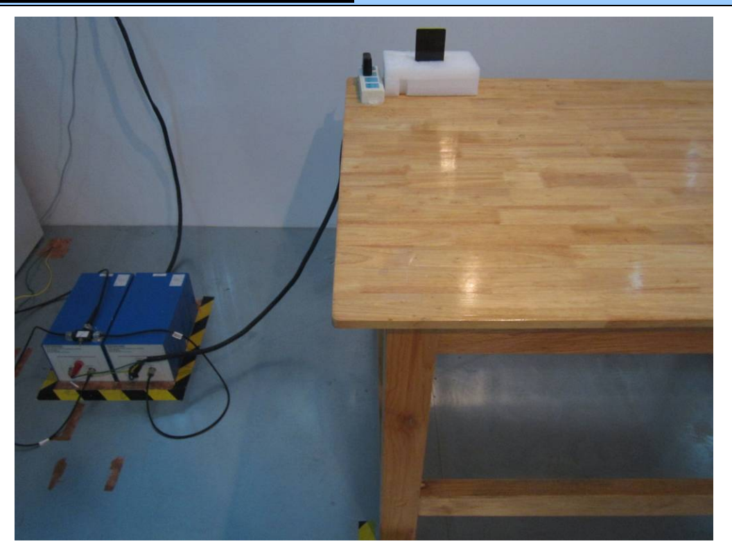
Conducted Emissions Test Setup Front View