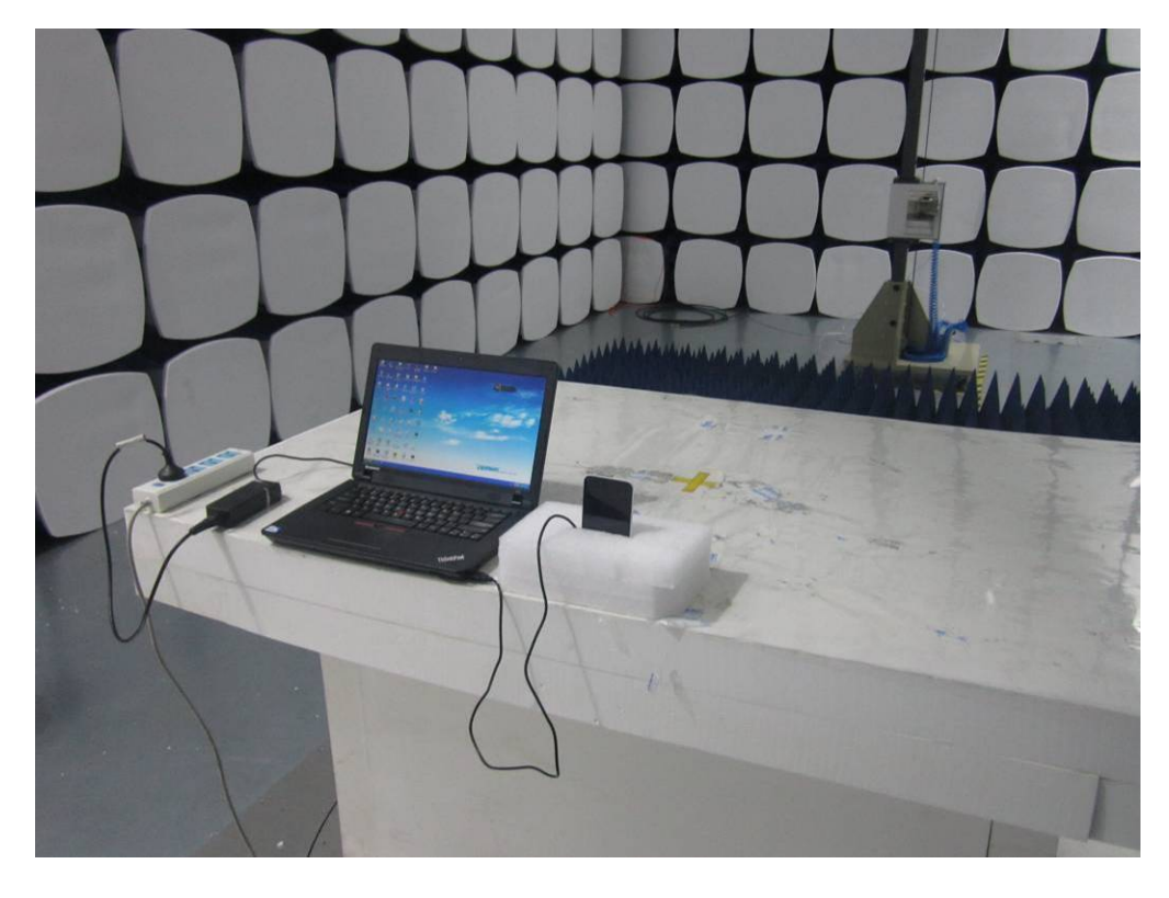
Radiated Spurious Emissions Test Setup Above 1GHz -Front View