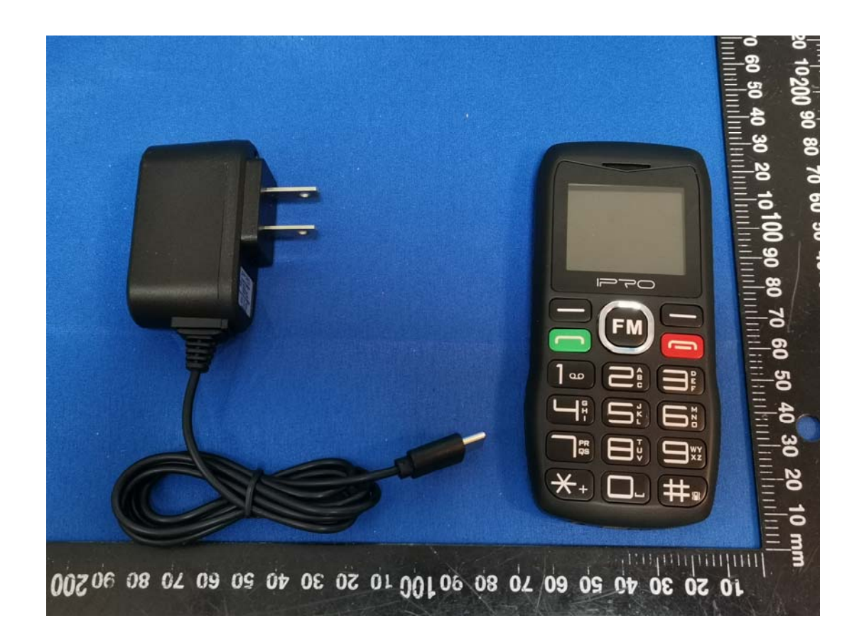
EXHIBIT B - EUT EXTERNAL PHOTOGRAPHS