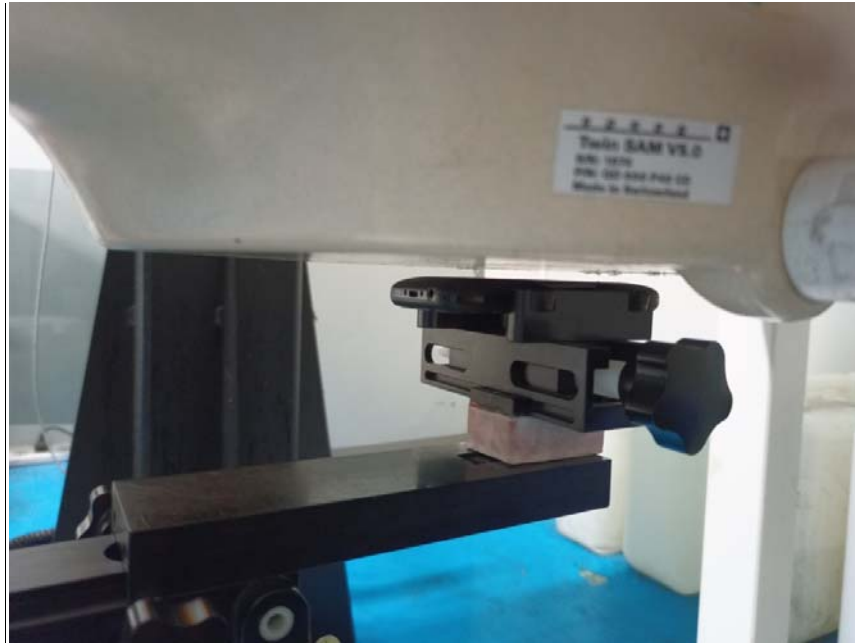
Body (Worn) Front Setup Photo (5mm)