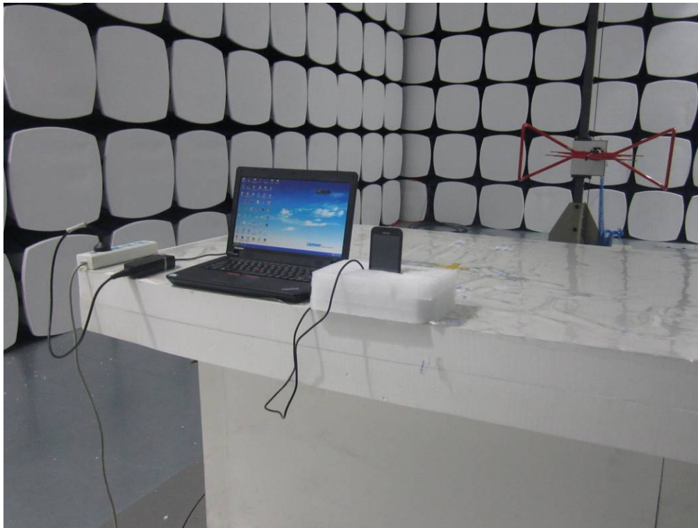
Radiated Spurious Emissions Test Setup Below 1GHz - Front View

Report No.: 14070279-FCC-E1 Issue Date: June 23, 2014 Page: 31 of 37 www.siemic.com www.siemic.com.cn