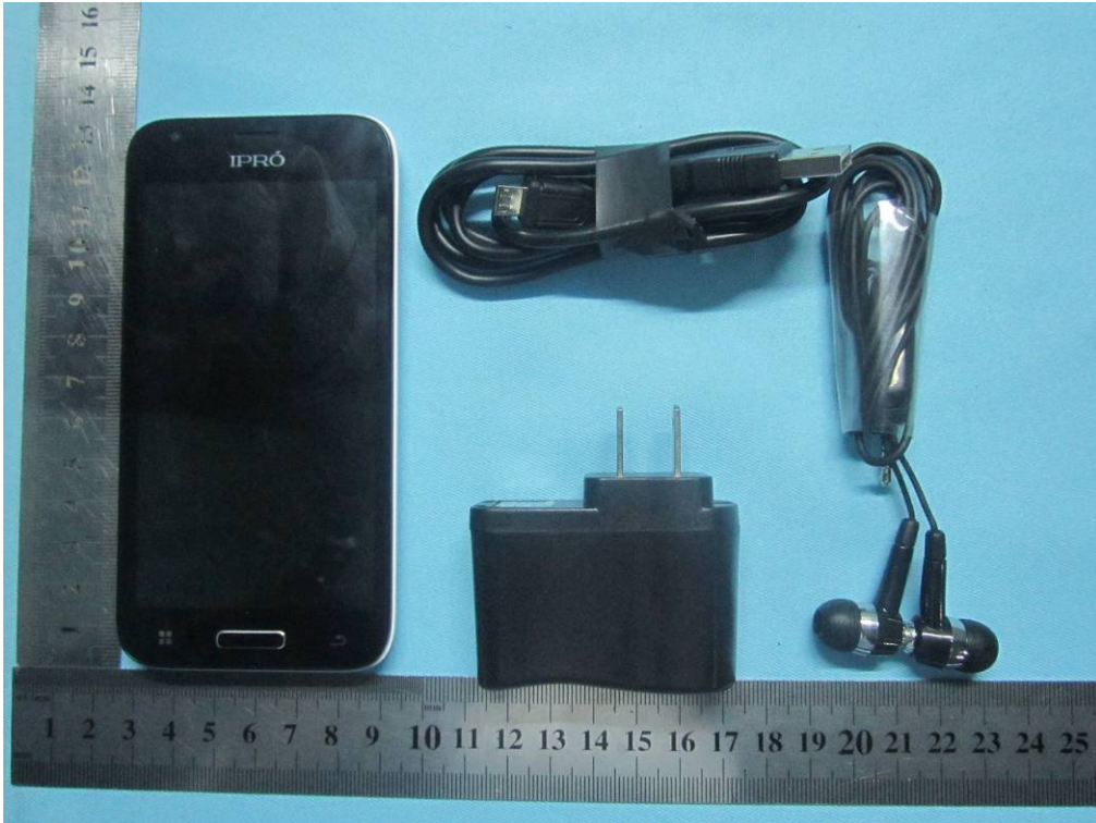
Whole Package - Top View