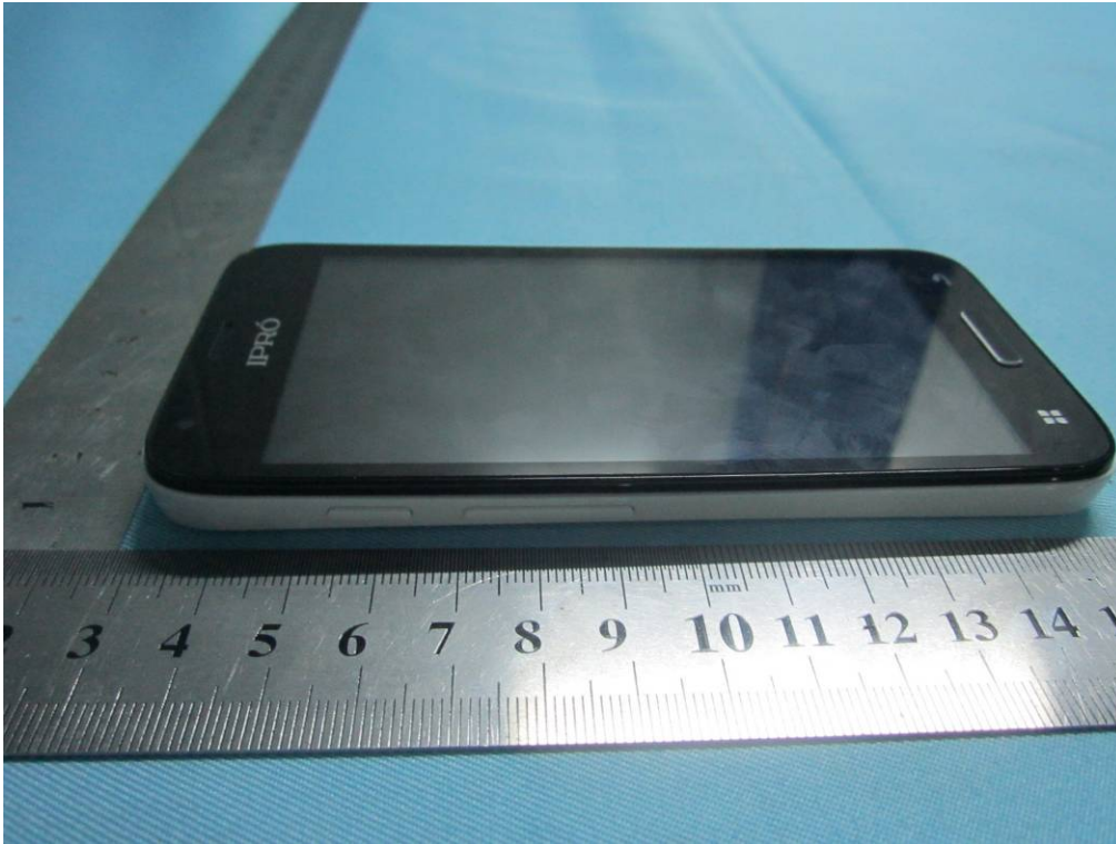
EUT - Left View

Report No.: 13070560-FCC-E1 Issue Date: November 30, 2013 Page: 22 of 37 www.siemic.com.cn