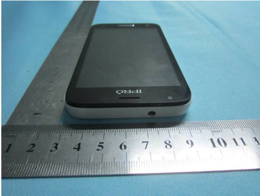
EUT - Top View

Report No.: 13070560-FCC-E1 Issue Date: November 30, 2013 Page: 21 of 37 www.siemic.com.cn