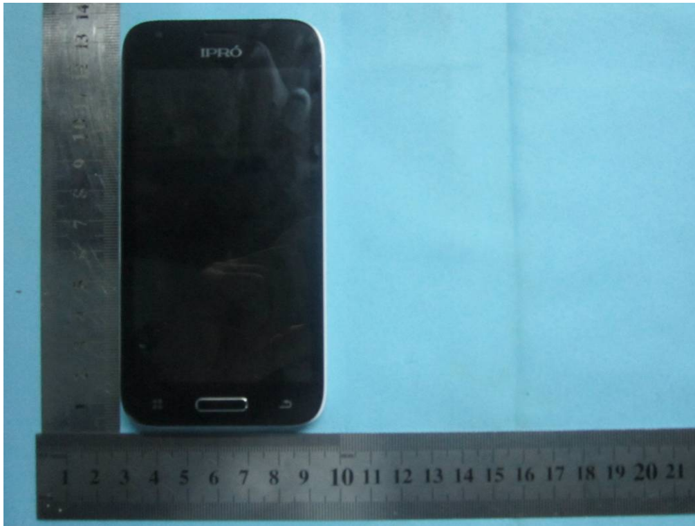
EUT - Front View

Report No.: 13070560-FCC-E1 Issue Date: November 30, 2013 Page: 20 of 37 www.siemic.com.cn