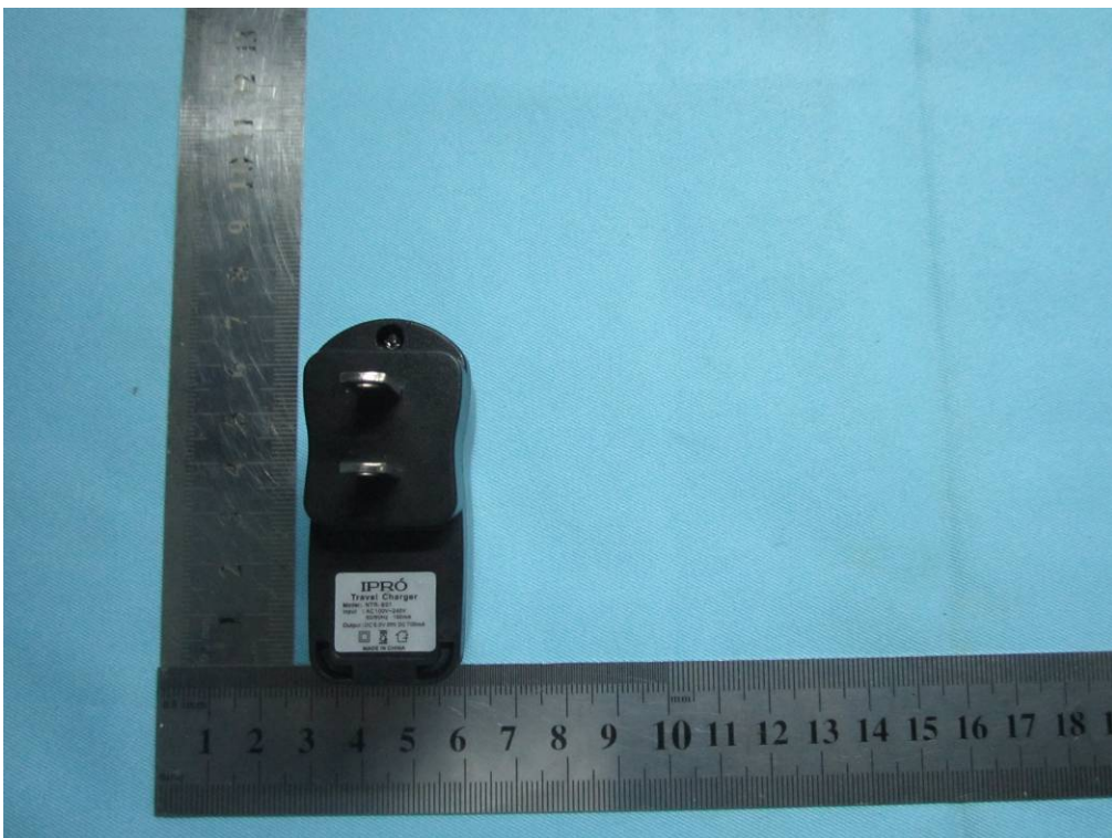
Adapter - Top View