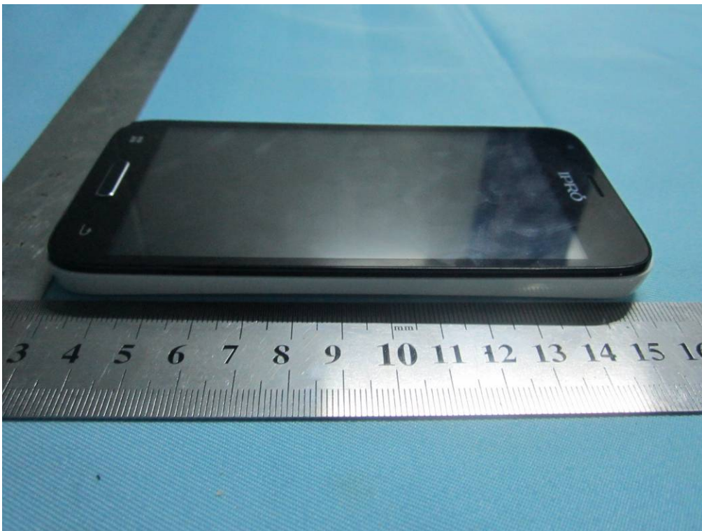
EUT - Right View