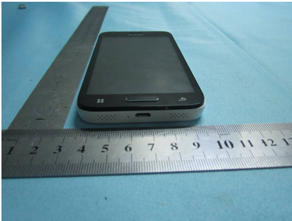
EUT - Bottom View