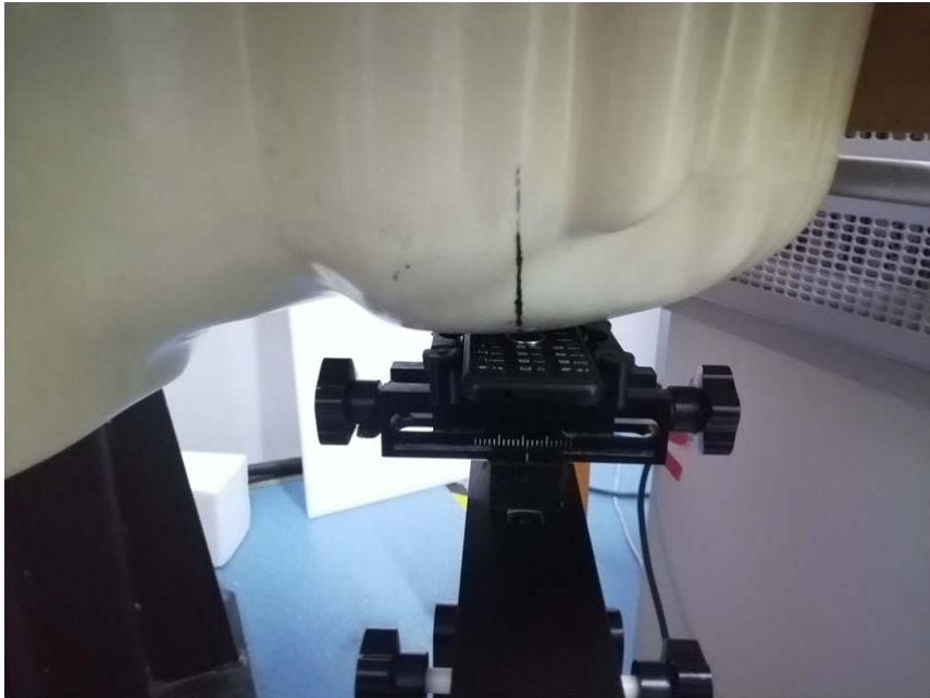
Head Left Tilt Setup Photo