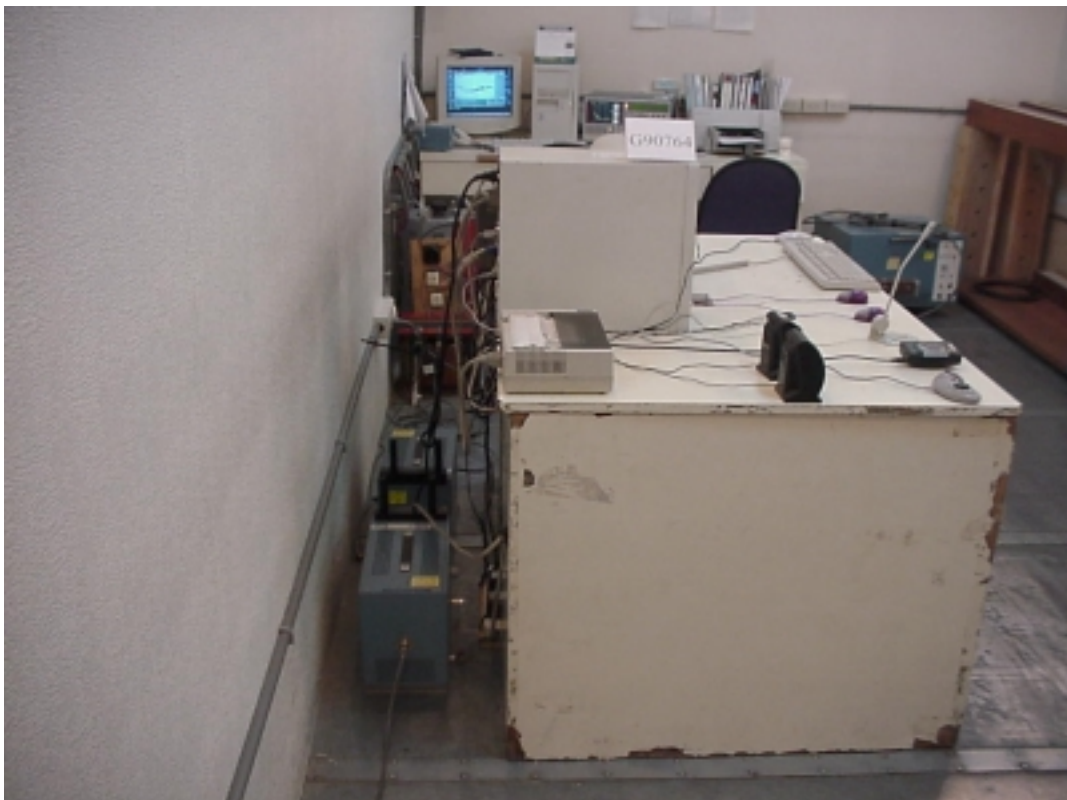
BACK VIEW OF CONDUCTED TEST