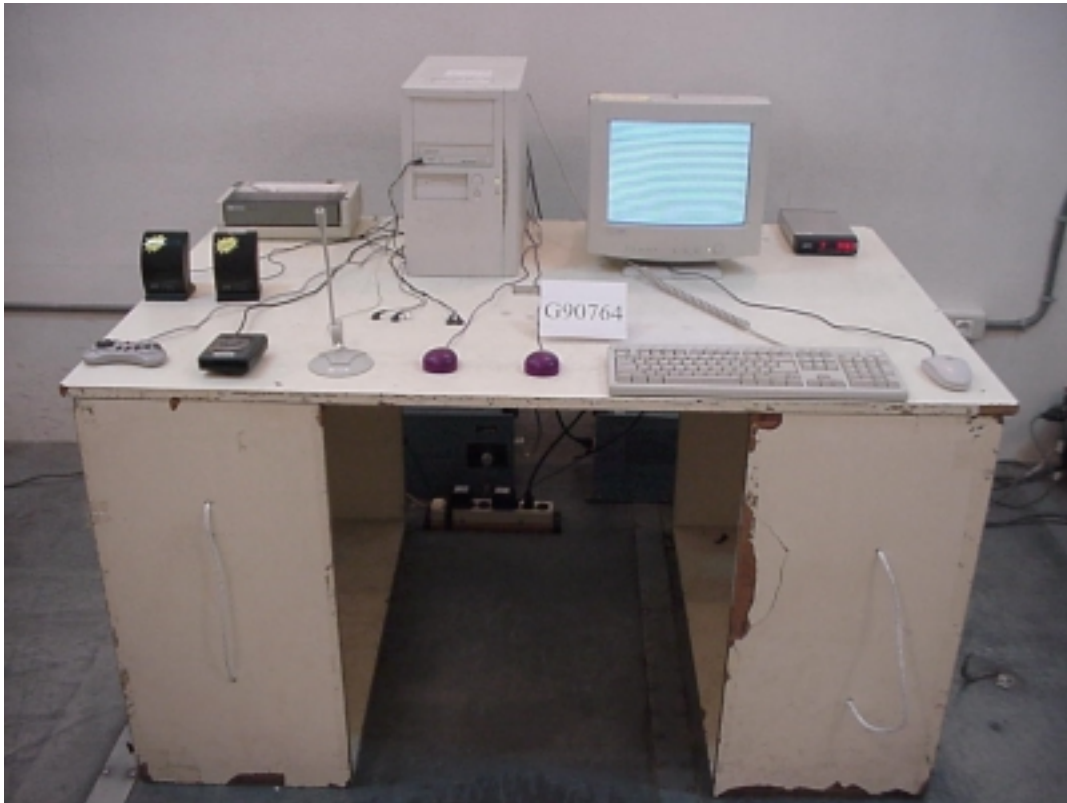
FRONT VIEW OF CONDUCTED TEST