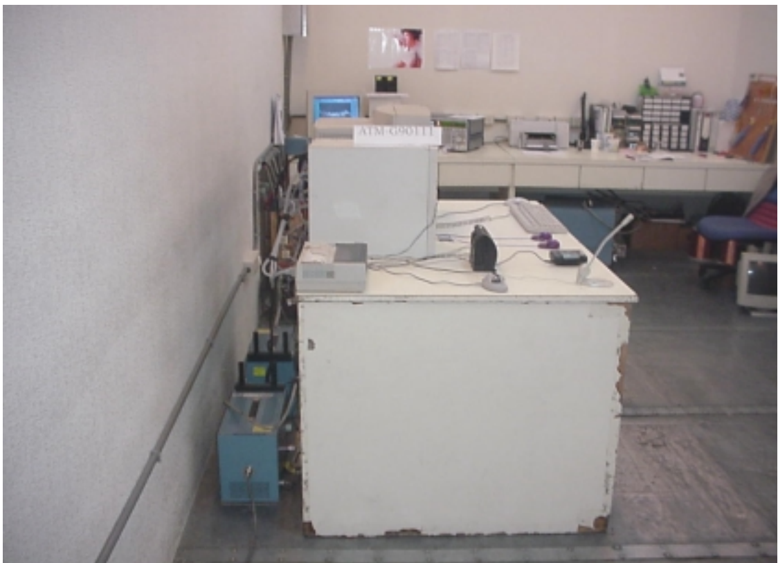
BACK VIEW OF CONDUCTED TEST