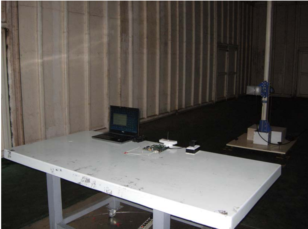
Back View of Radiated Test (Horn)