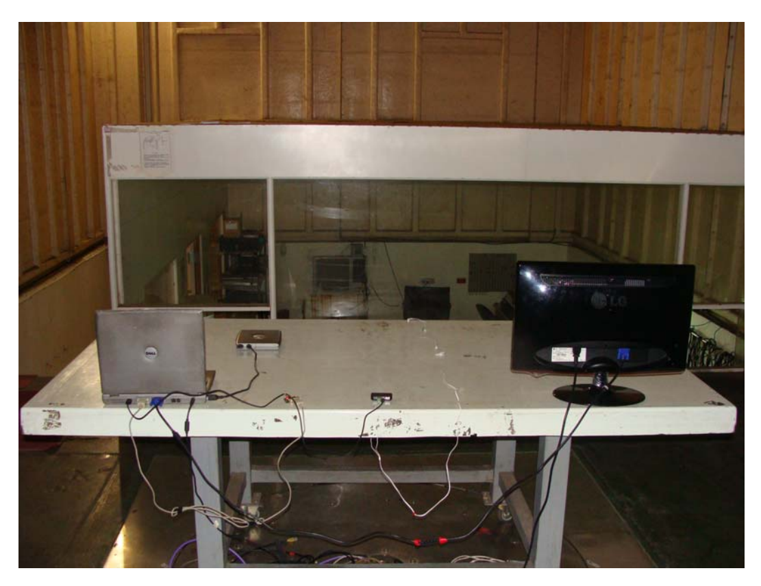
Back View of Radiated Test (Horn)