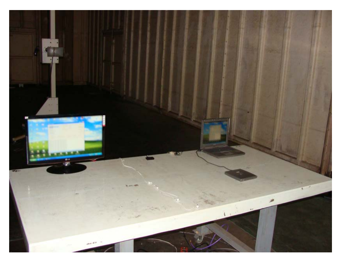
Front View of Radiated Test (Horn)