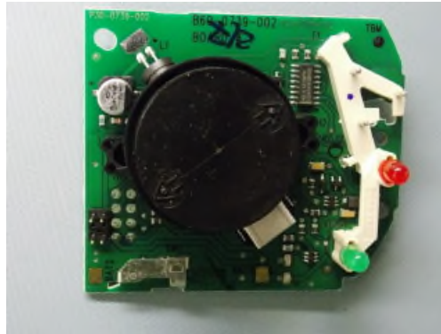
Control PCB Rear