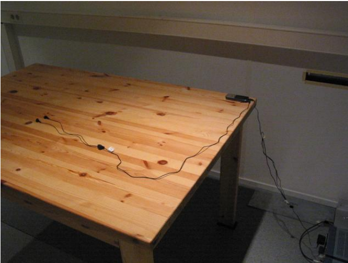
Picture 3. FCC Part 15C AC powerline conducted emissions