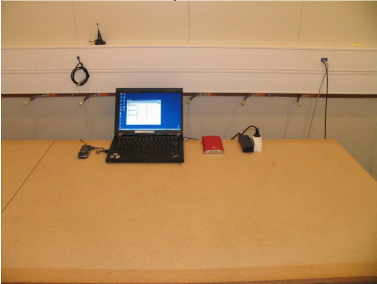
Picture 4. FCC Part 15B AC powerline conducted emissions