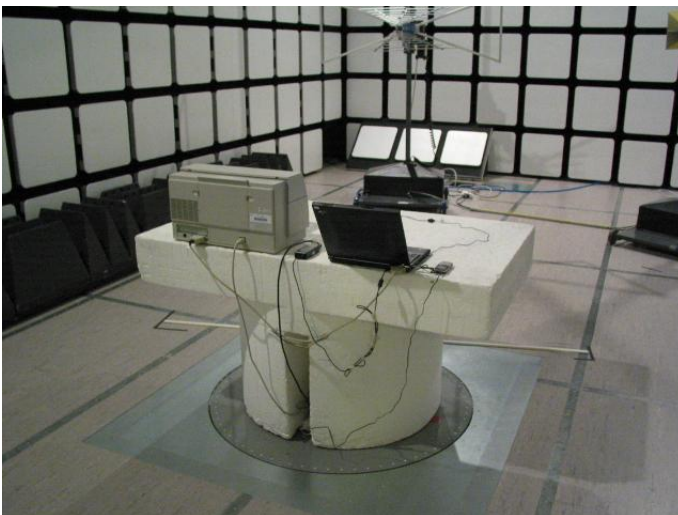
Picture 2. FCC Part 15B Radiated emissions