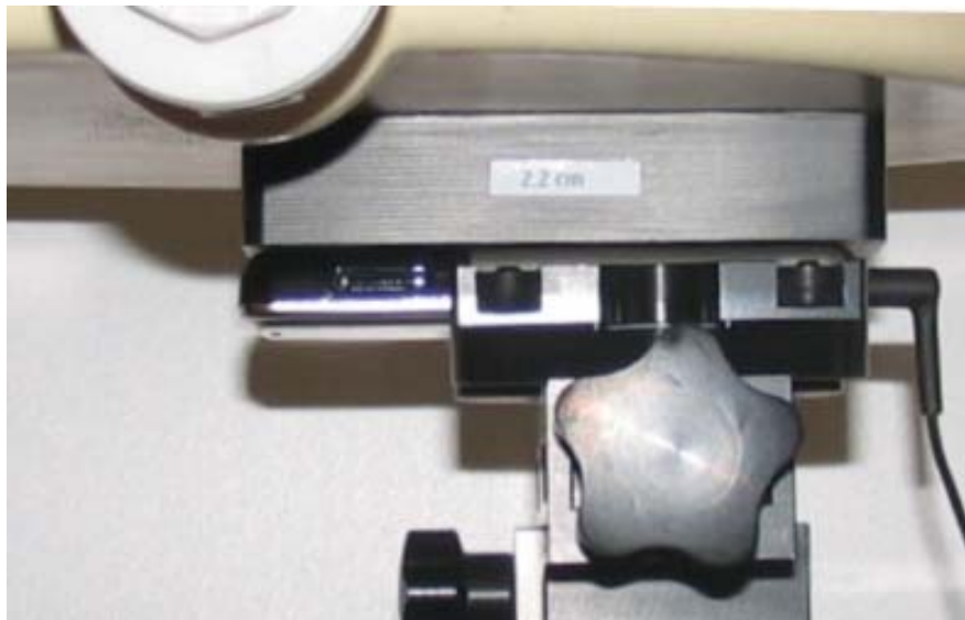
Photo of the device positioned for Body SAR measurement. The spacer was removed for the tests.

The device was placed in the SPEAG holder using the Nokia spacer and placed below the flat section of the phantom. The distance between the device and the phantom was kept at the separation distance indicated in the photo below using a separate flat spacer that was removed before the start of the measurements. The device was oriented with its antenna facing the phantom since this orientation gives higher results.