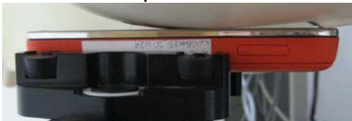
HW 0213: Photo of the device in “cheek” position