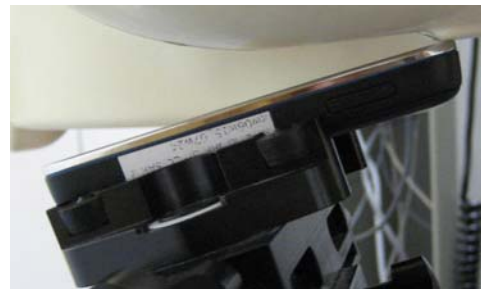
HW 0210: Photo of the device in “tilt” position