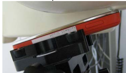
HW 0213: Photo of the device in “tilt” position