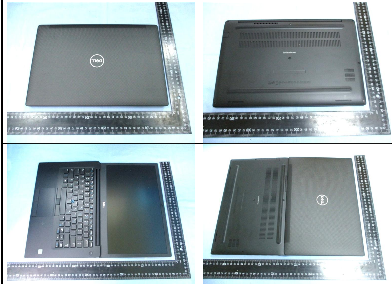
EUT with CF Cover