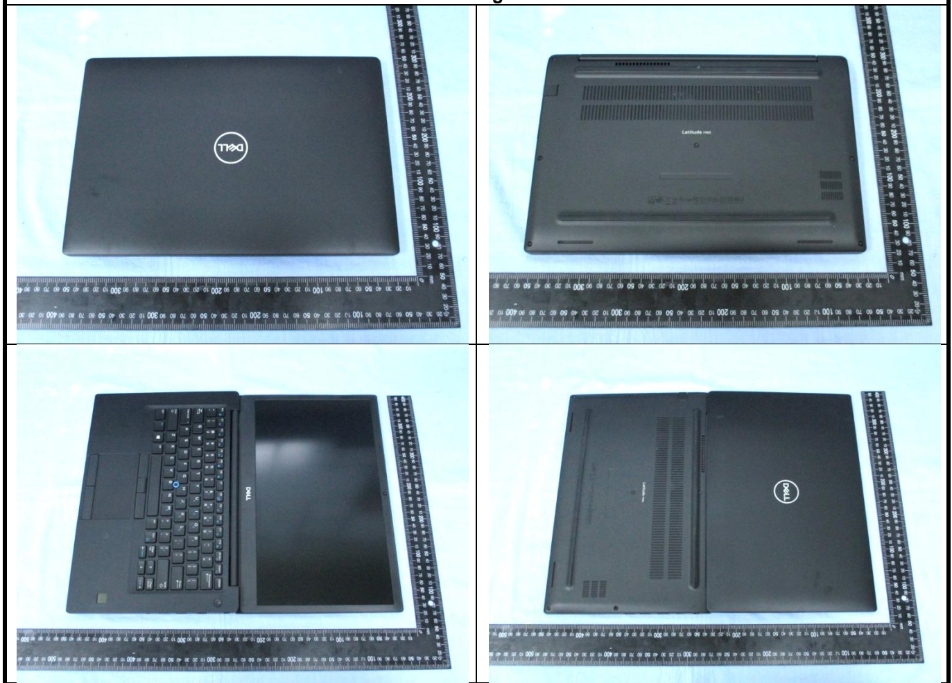
EUT with Mg Cover