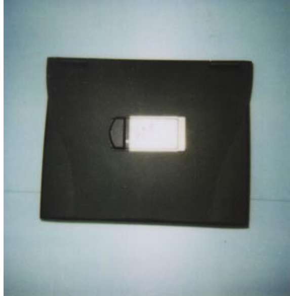
Fig. 2. A picture of the Model AR5BCB-00021 CardBus card placed on the laptop computer.