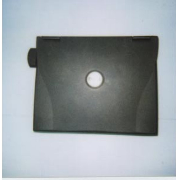
Fig. 1. Photograph of the Atheros Communications Model AR5BCB-00021 CardBus card inserted into a laptop computer.