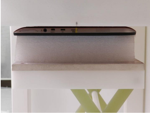
Bottom Face, Test Separation 0 cm