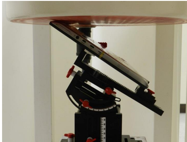
Curved surface of Edge1, Test Separation 0 cm