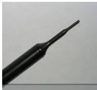
Interior of probe

Application: High precision dosimetric measurements in any exposure scenario (e.g., very strong gradient fields). Only probe which enables compliance testing for frequencies up to 6 GHz with precision of better 30%.