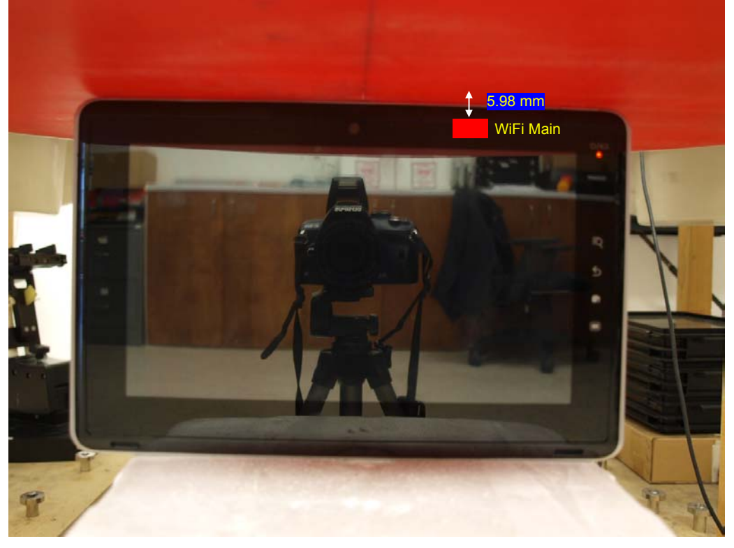
Tablet - Edge: Primary Portrait