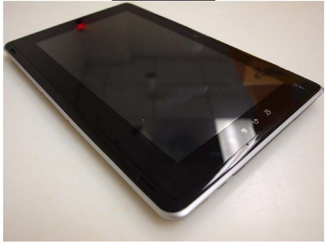
Tablet Mode - Bottom View