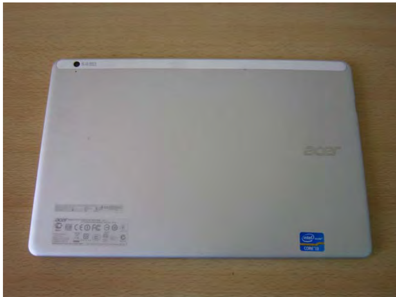
Fig.2 Back view of EUT

Unless otherwise stated the results shown in this test report refer only to the sample(s) tested and such sample(s) are retained for 90 days only.