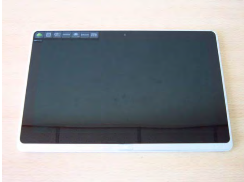
Fig.1 Front view of EUT