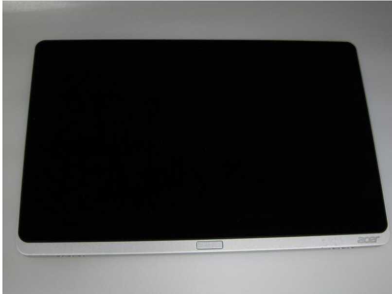
Fig.1 Front view of EUT