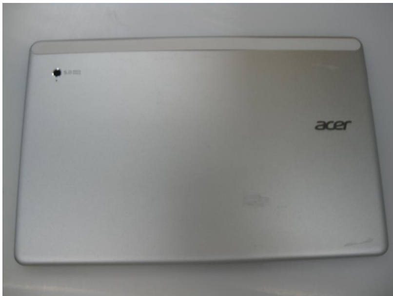
Fig.2 Back view of EUT

Unless otherwise stated the results shown in this test report refer only to the sample(s) tested and such sample(s) are retained for 90 days only.