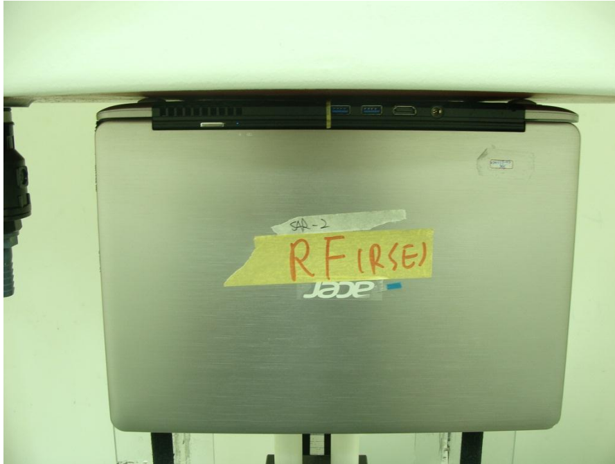
notebook bottom NB Mode with 0 cm gap