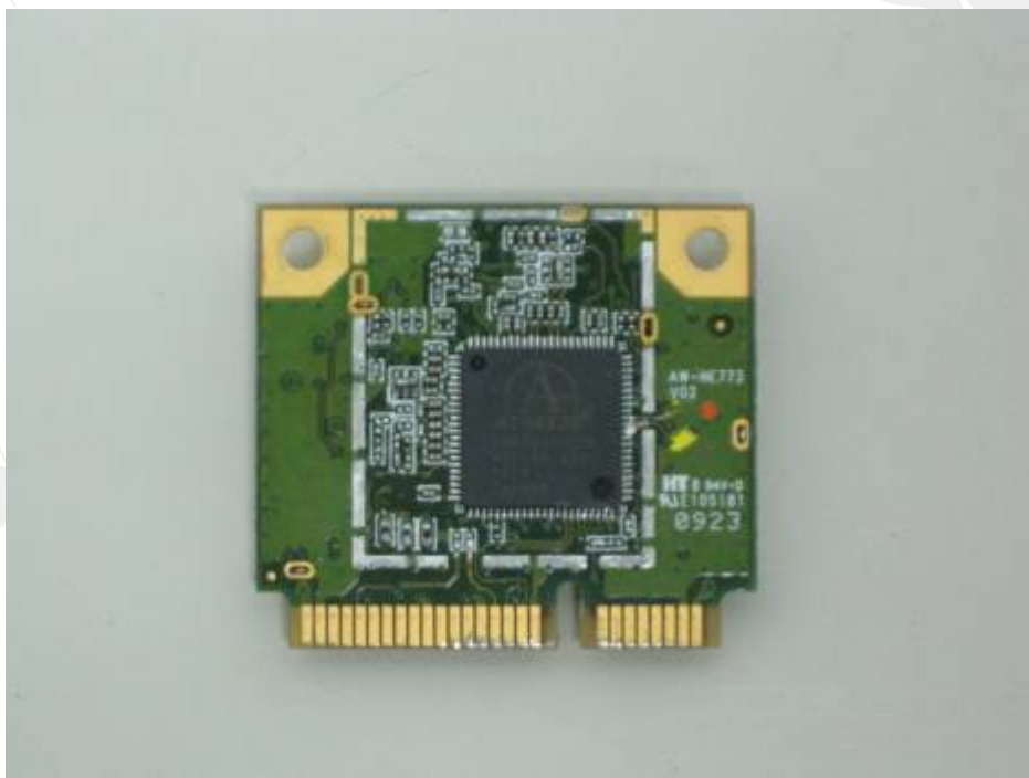
WLAN Module (AW-NE773)

Unless otherwise stated the results shown in this test report refer only to the sample(s) tested and such sample(s) are retained for 90 days only. 除非另有說明，此報告結果僅對測試之樣品負責，同時此樣品僅保留90天。本報告未經本公司書面許可，不可部份複製。