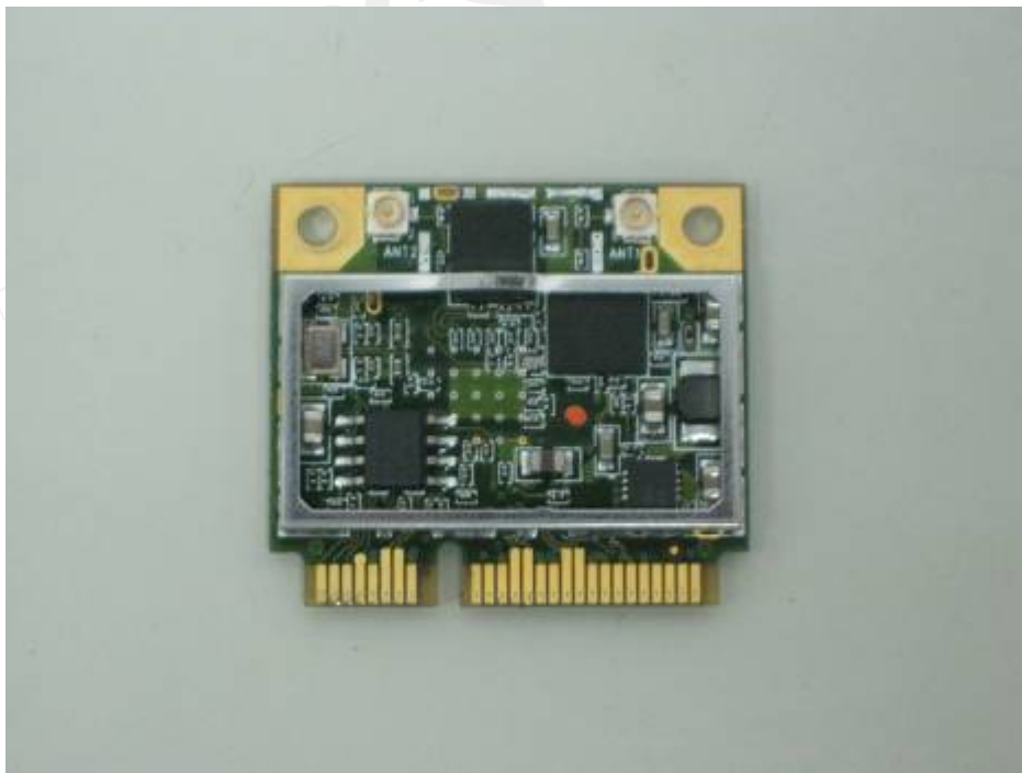
WLAN Module (AW-NE773)