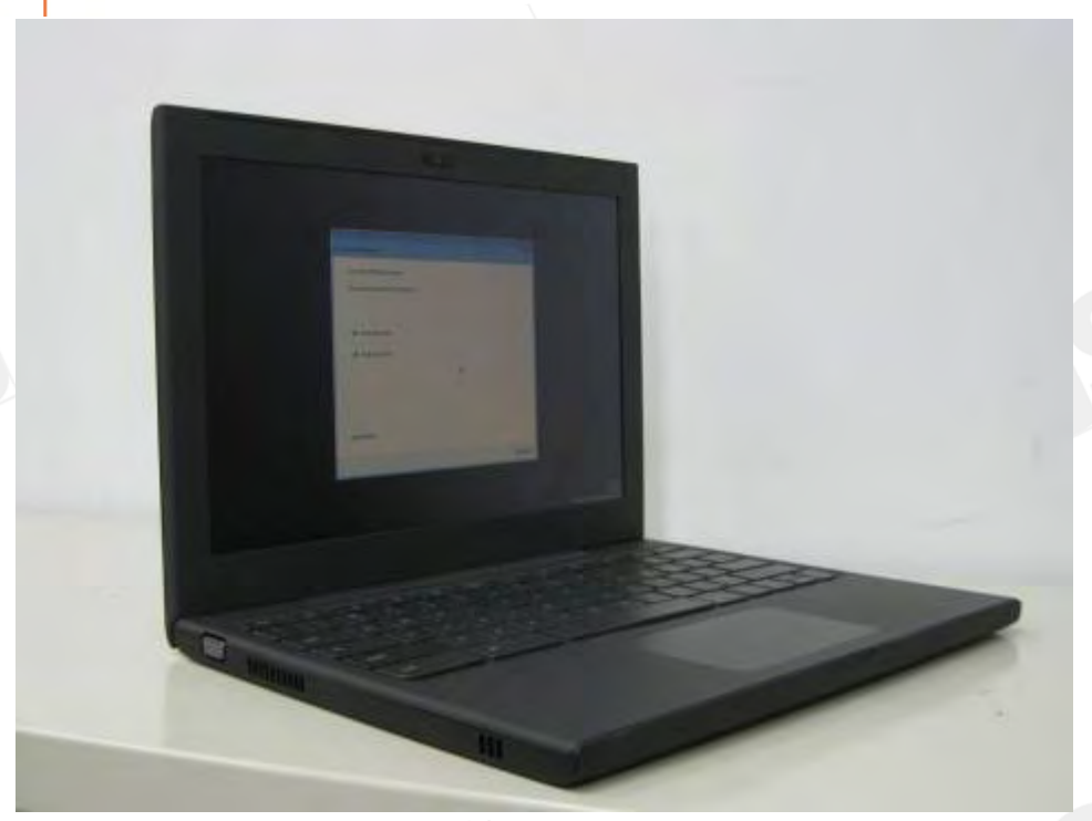
Fold up of EUT