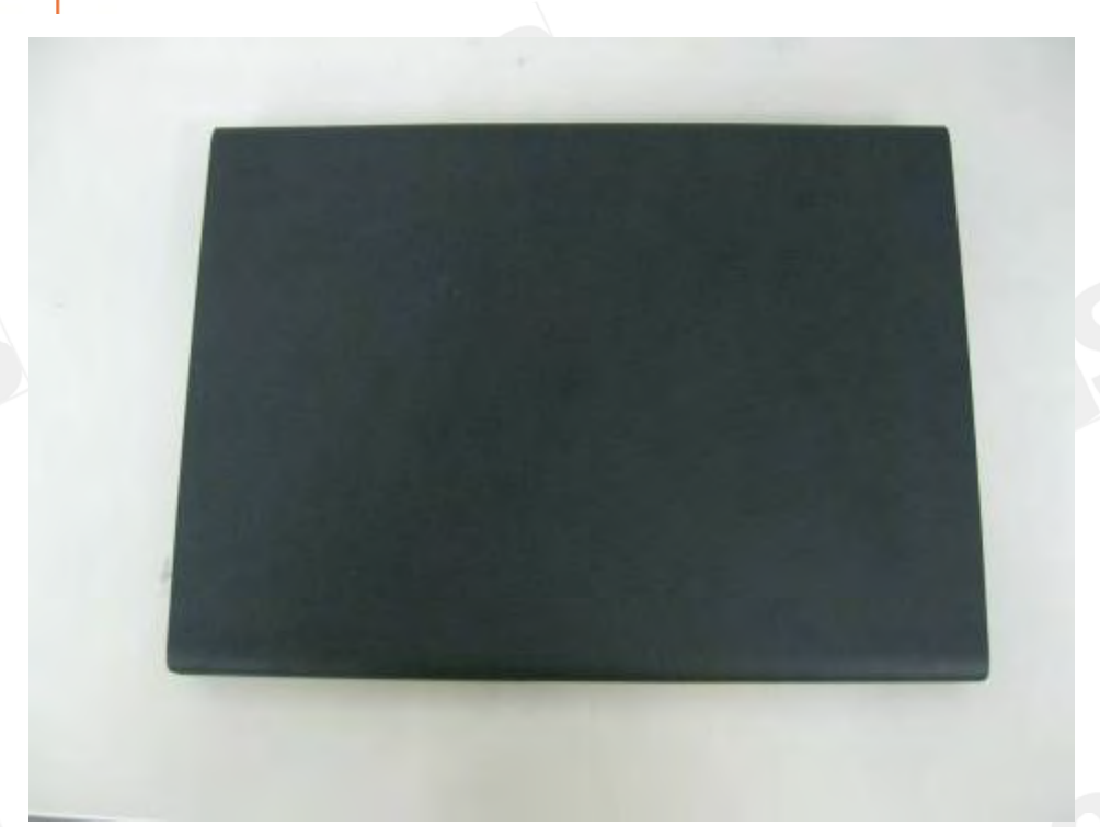
Front view of EUT