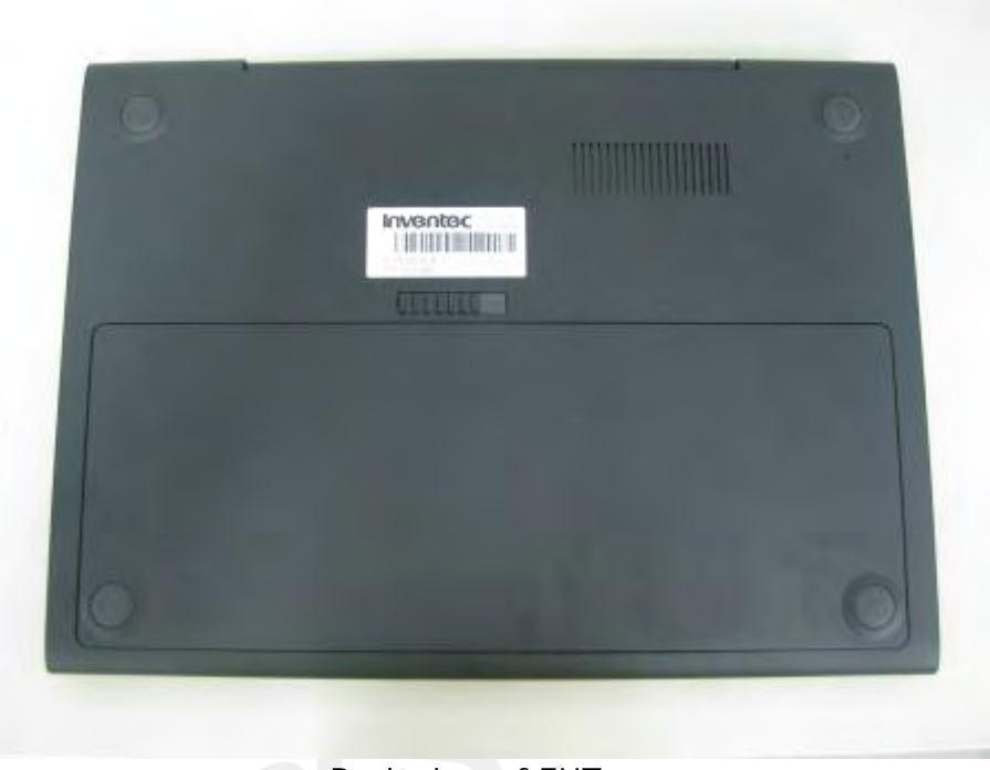
Back view of EUT

Unless otherwise stated the results shown in this test report refer only to the sample(s) tested and such sample(s) are retained for 90 days only. 除非另有說明,此報告結果僅對測試之樣品負責,同時此樣品僅保留90天。本報告未經本公司書面許可,不可部份複製。