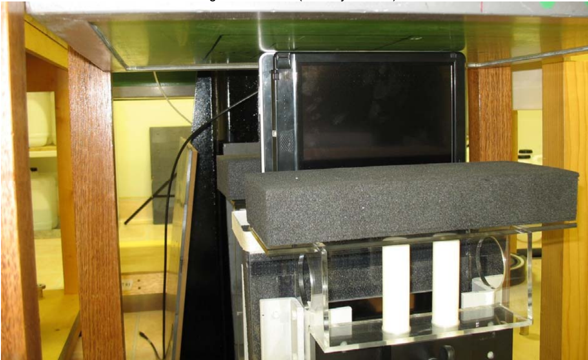
Edge On Position (Primary Portrait)