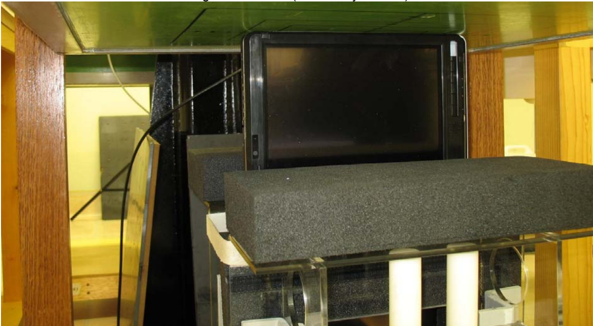
Edge On Position (Secondary Portrait)