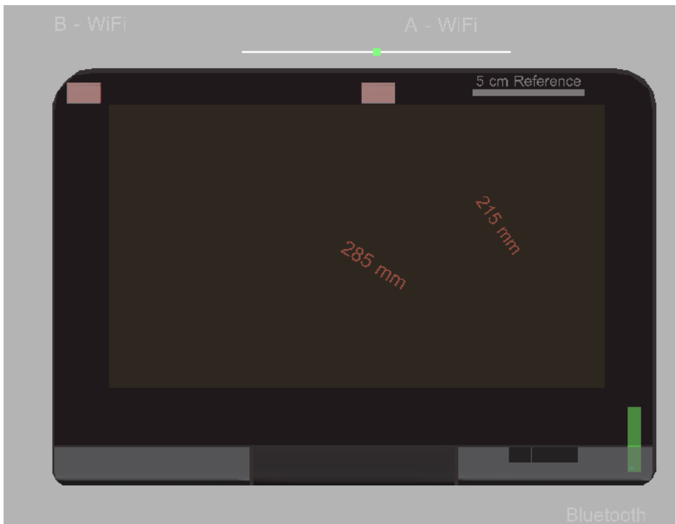
Diagram Showing distance between the Bluetooth and the WLAN antennas

NOTE: Throughout this report, Antenna A, and B refer to Tx1, and Tx2 in the host respectively.