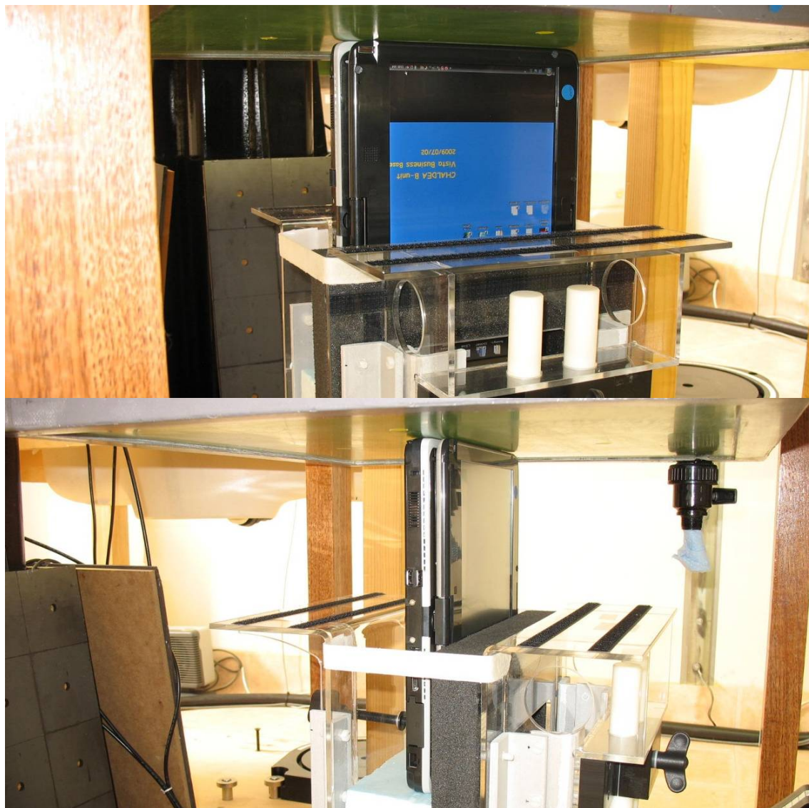
Edge On Position (Primary Portrait)