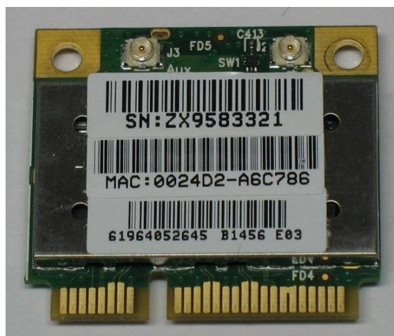
Model: BSMAN3 - Bluetooth Module