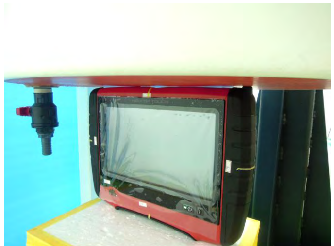
Secondary Landscape of EUT with 0 cm Gap