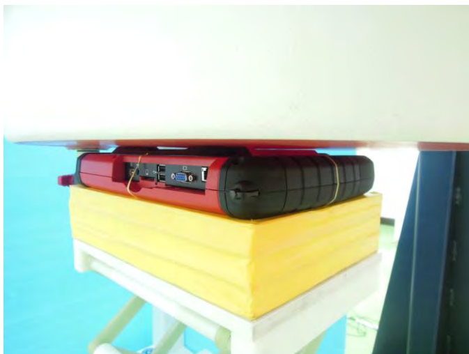
Rear Face of EUT with 0 cm Gap