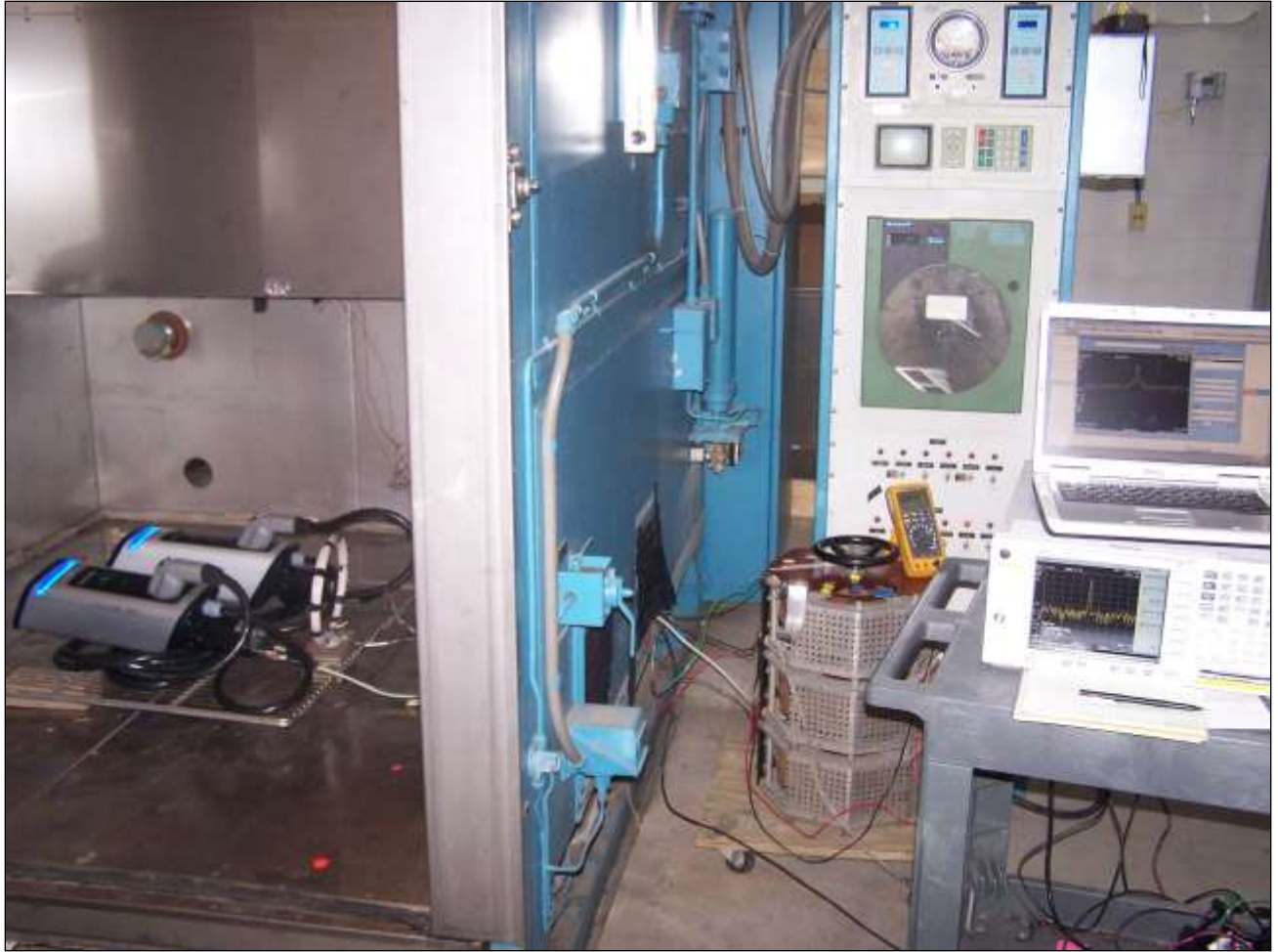
Photograph 7. Frequency Stability, Test Setup