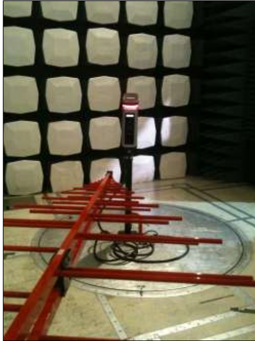
Photograph 2. Radiated Emission, Test Setup, Mean-Well