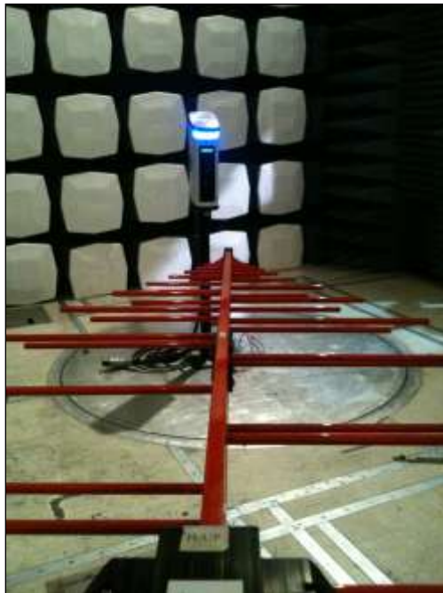
Photograph 3. Radiated Emission, Test Setup, TDK-Lambda