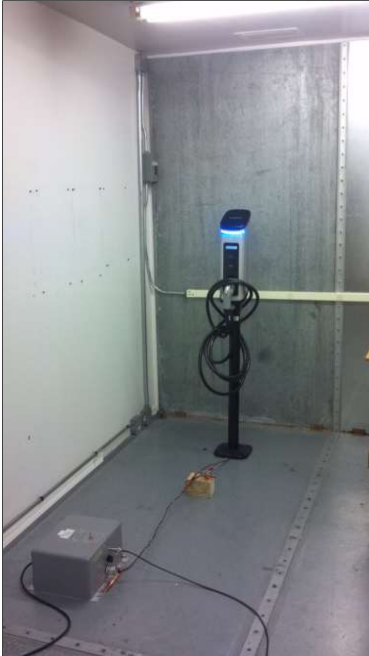
Photograph 4. Conducted Emissions, 15.207(a), Test Setup