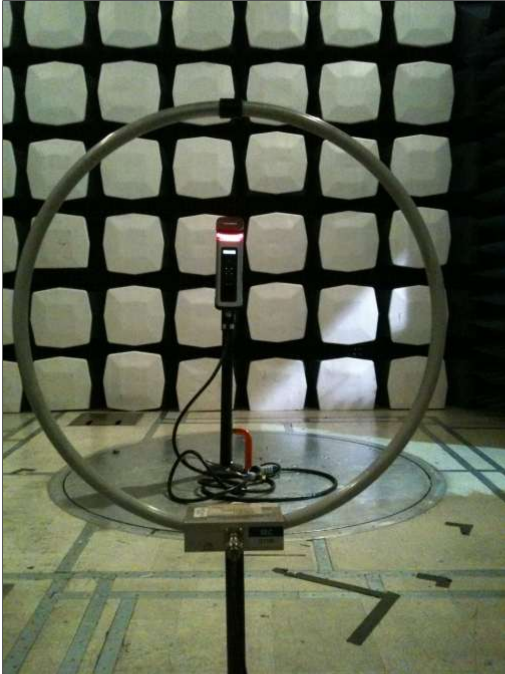
Photograph 5. Field Strength of Fundamental Emission, Test Setup