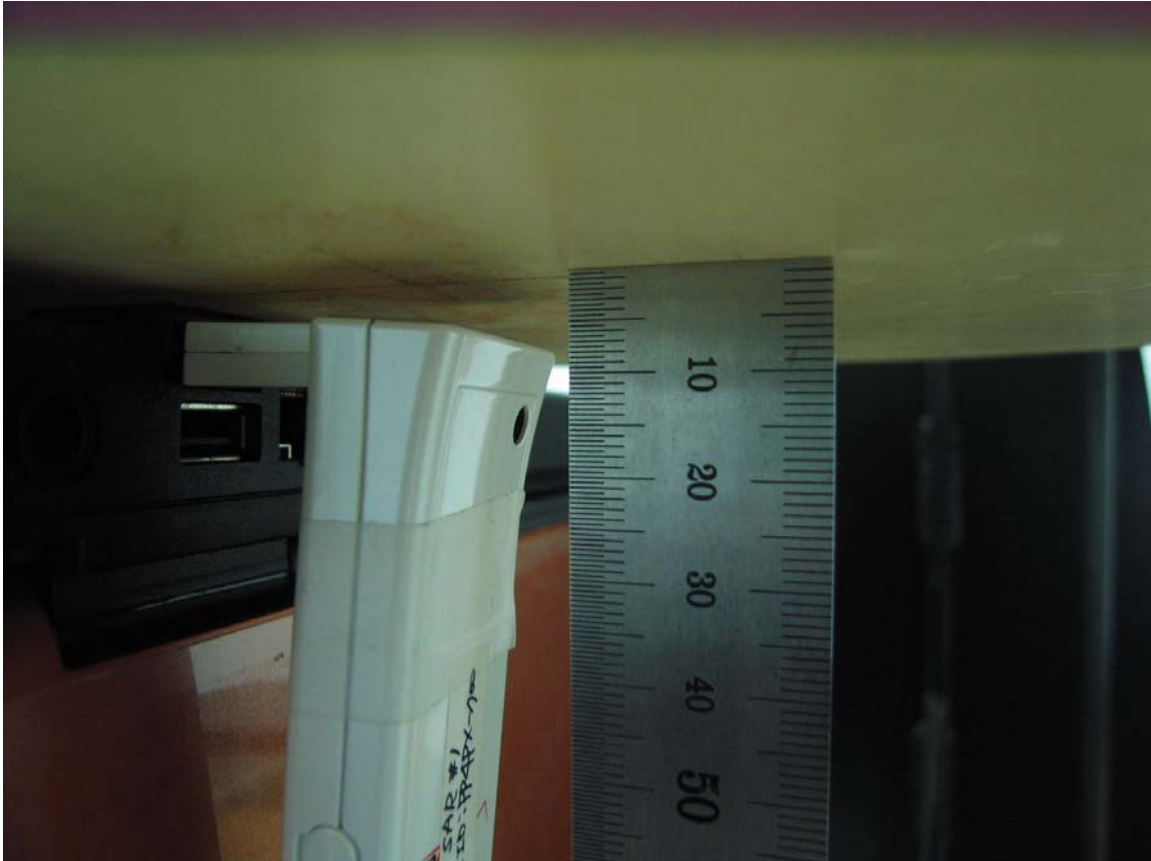
[Distance of 0.8 cm from the EUT]