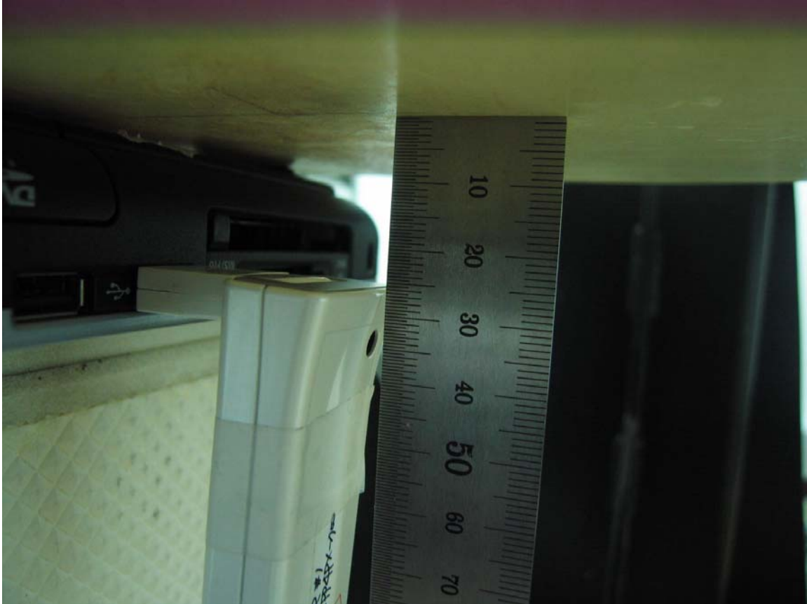
[Distance of 2.5 cm from the EUT]