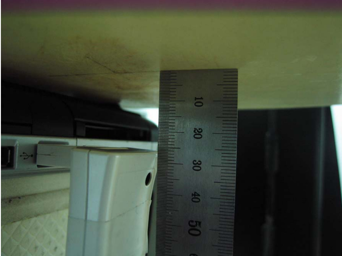
[Distance of 2.5 cm from the EUT]