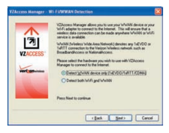
STEP 4: The VZAccess Manager will now detect and setup your WWAN device.

STEP 3: In this step of the Setup Wizard you must specify the type of wireless device that you intend to use with VZAccess Manager. Select either "Detect WWAN device only" or "Detect both Wi-Fi and WWAN." For the purposes of this guide, "Detect WWAN device only" will be used. Please note that your experience in Step 4 may be different if you use a different selection. After making the appropriate selection, click Next to continue.