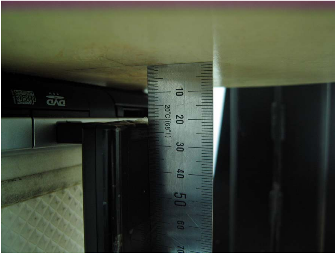
[Distance of 2.0 cm from the EUT]