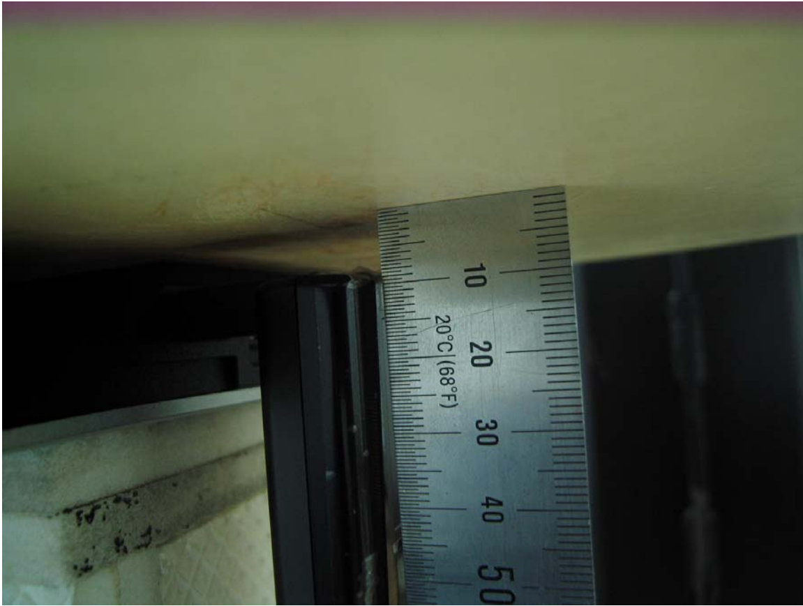
[Distance of 2.0 cm from the EUT]