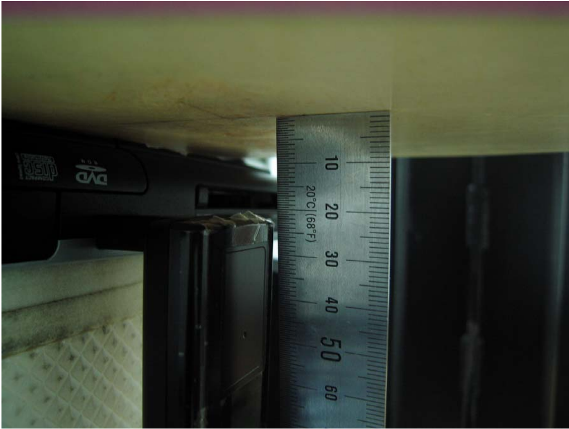
[Distance of 2.0 cm from the EUT]