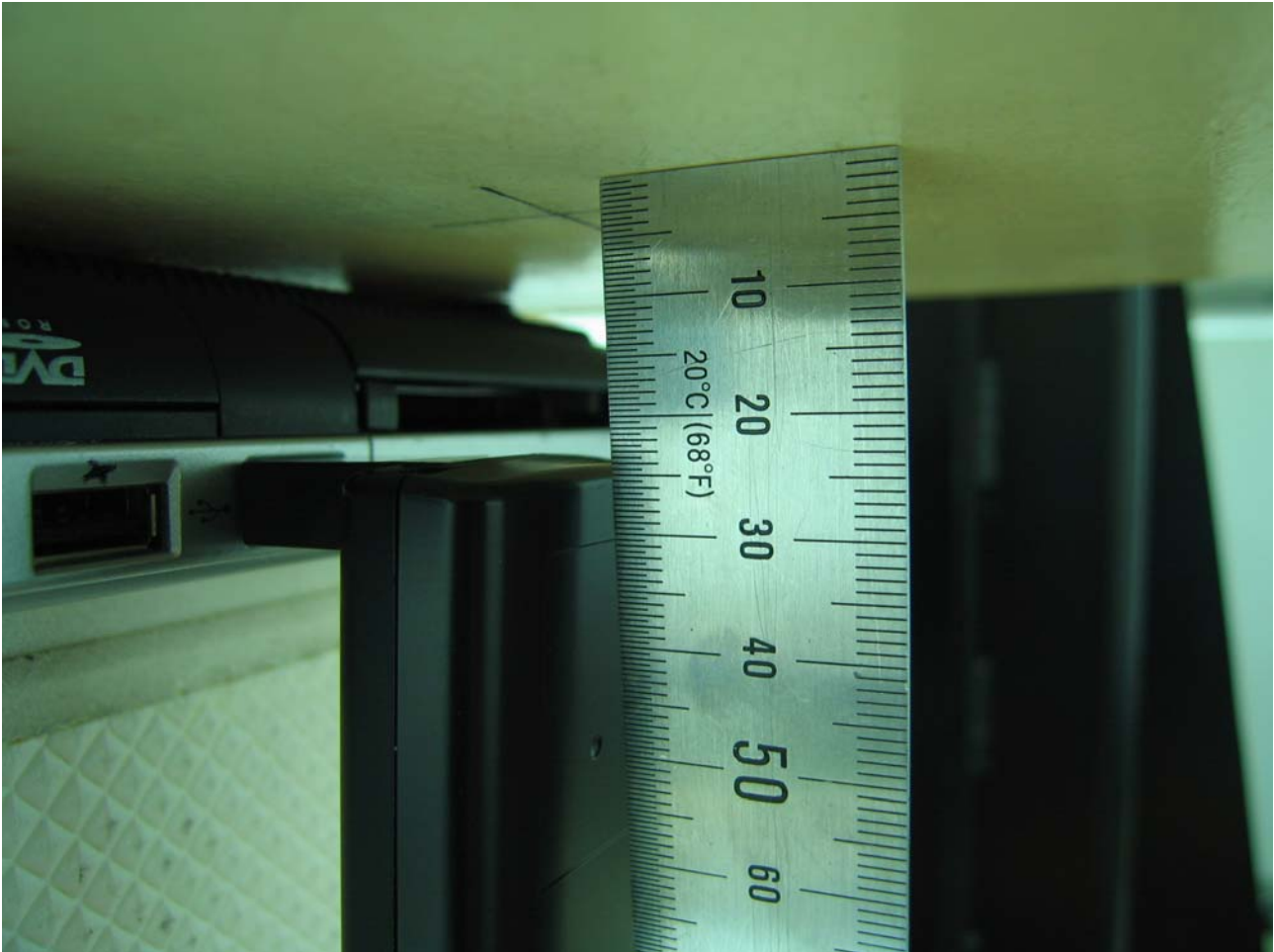
[Distance of 2.5 cm the EUT]