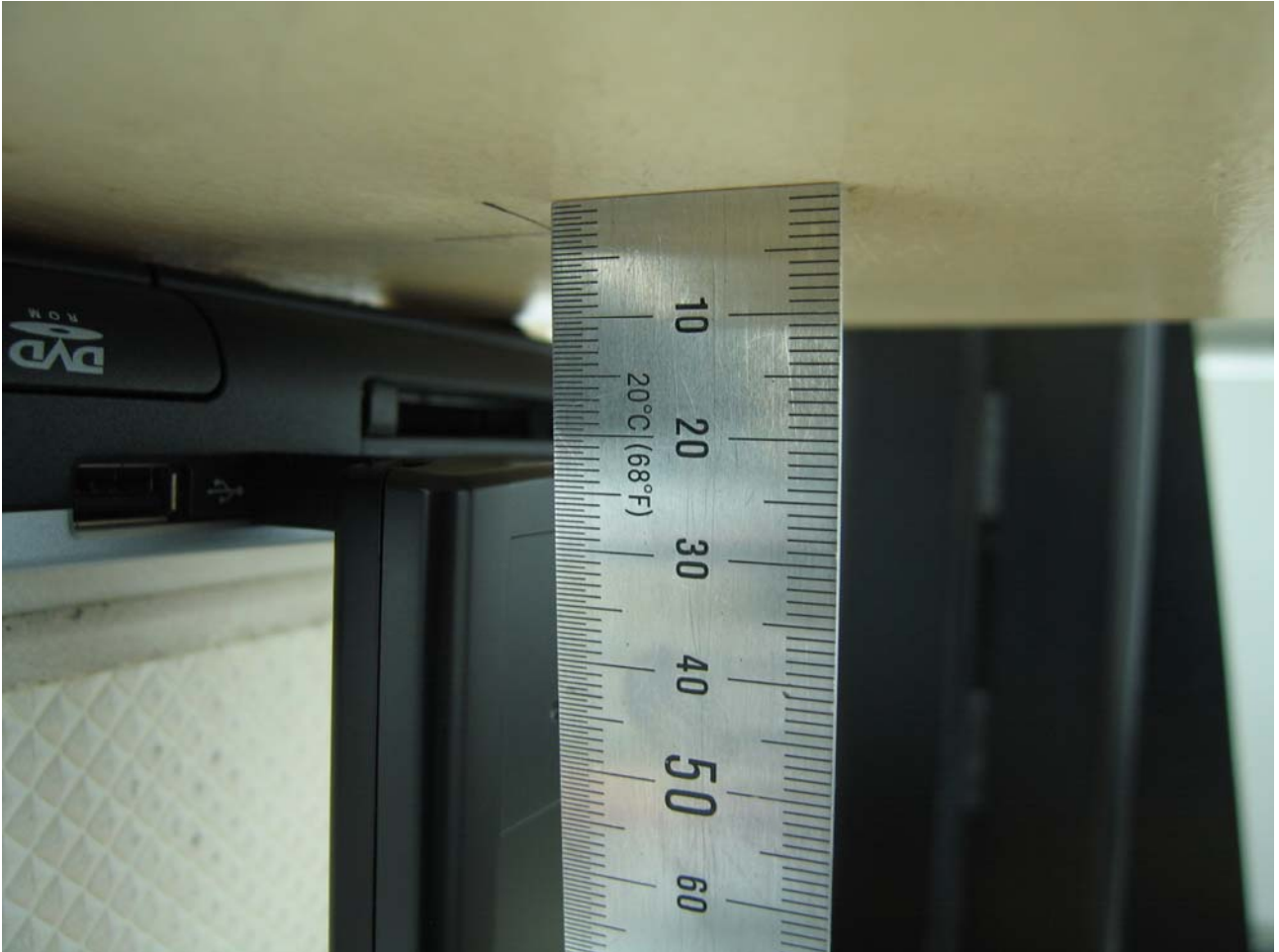
[Distance of 2.2 cm the EUT]