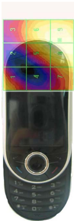
E-Field WD Scan overlay