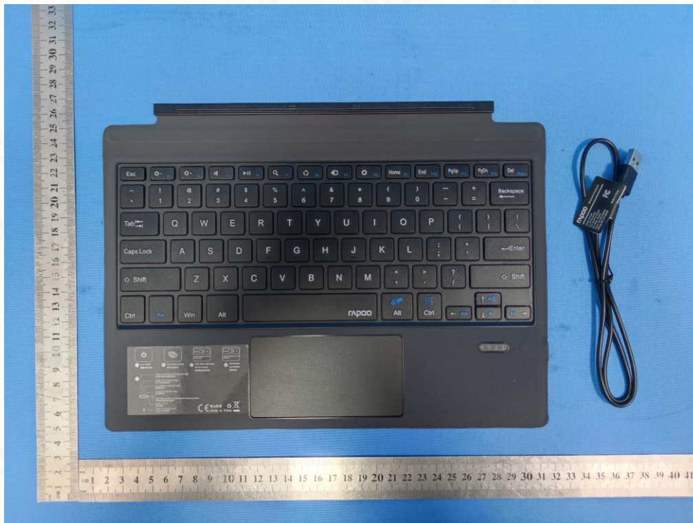
TOP VIEW OF EUT