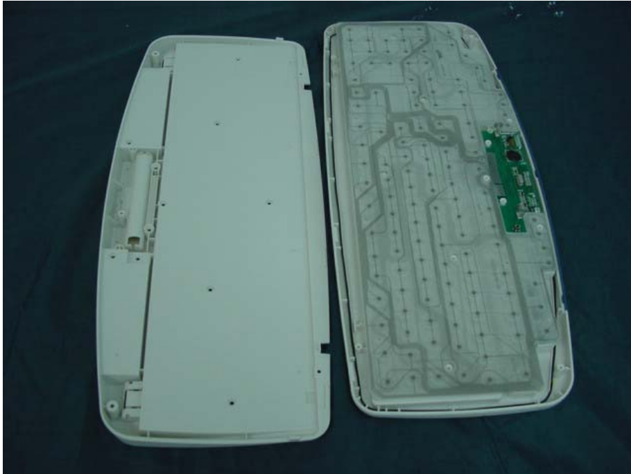
(4) Main board component side