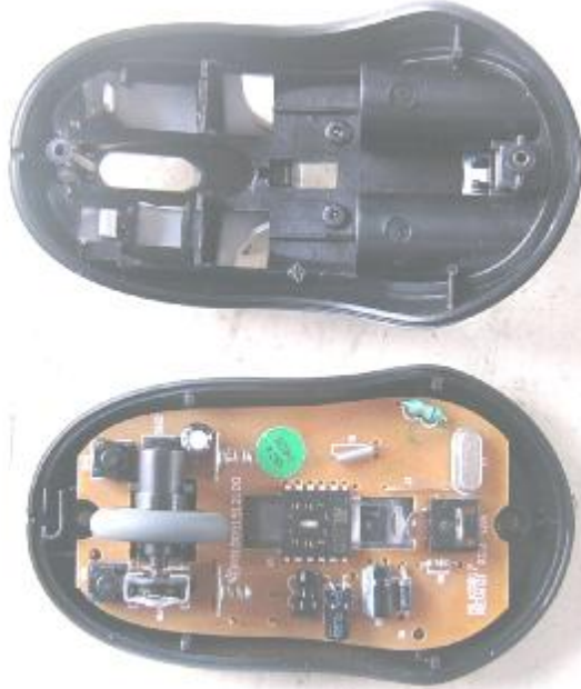
Main board component side