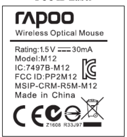
Proposed FCC ID Label Location